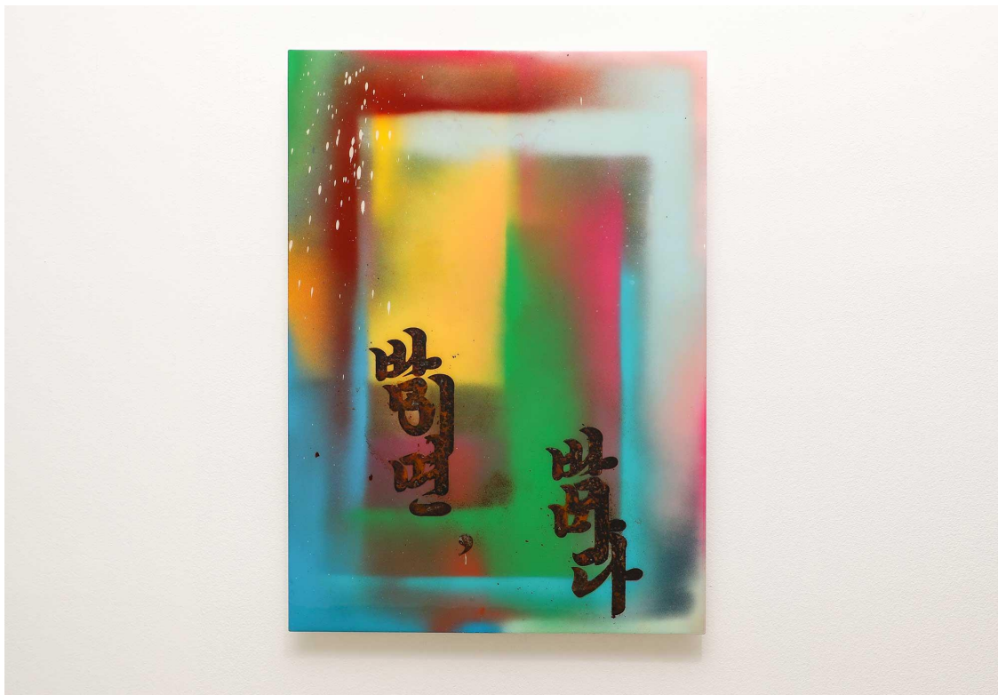
Kichang Choi, Lucky Drawing , 2021. Spray paint on oxidized steel plate, resin, 70 x 50 cm.