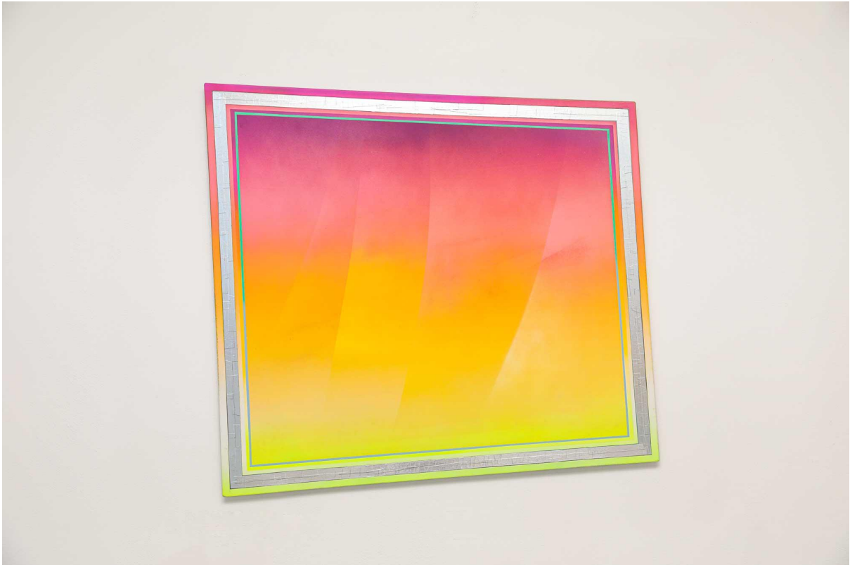
Kichang Choi, Rainbow Sequence: #5 , 2021. Spray paint on oxidized steel plate, aluminum, 80 x 84 cm.