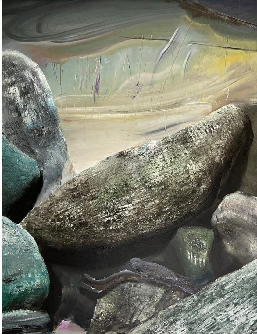
AHN Jisan, One Hour Before Sunrise , 2021, Oil on canvas, 116.8 x 91 cm