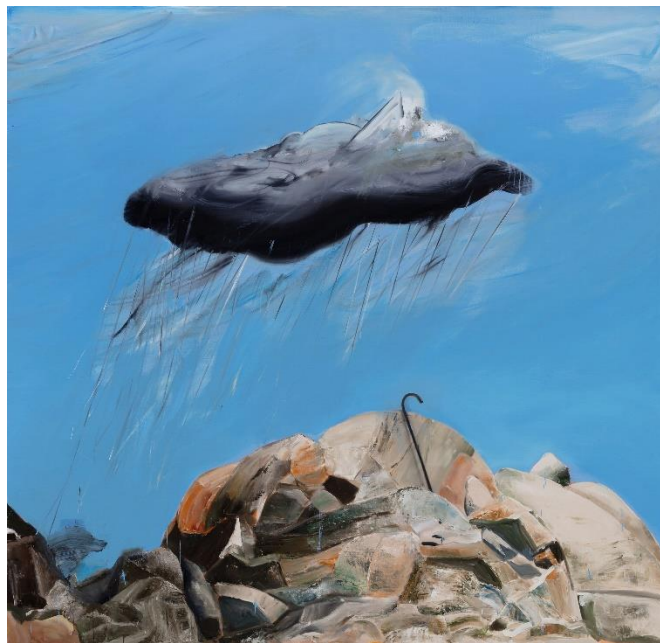
AHN Jisan, The Place Where the Rain Cloud Is Not Moving , 2021, Oil on canvas, 250 x 260 cm