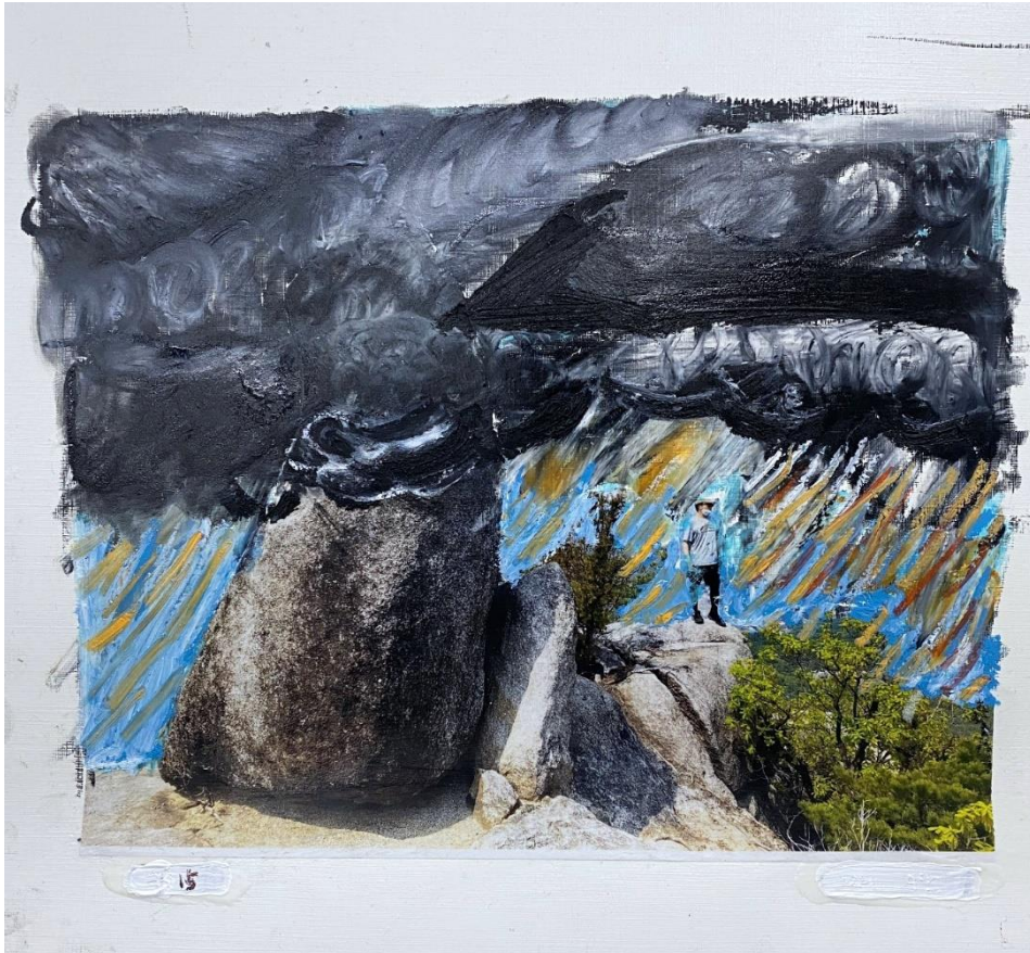
AHN Jisan, Storm 15 , 2021, Acrylic, collage, and oil pastel on paper, 30 x 40 cm