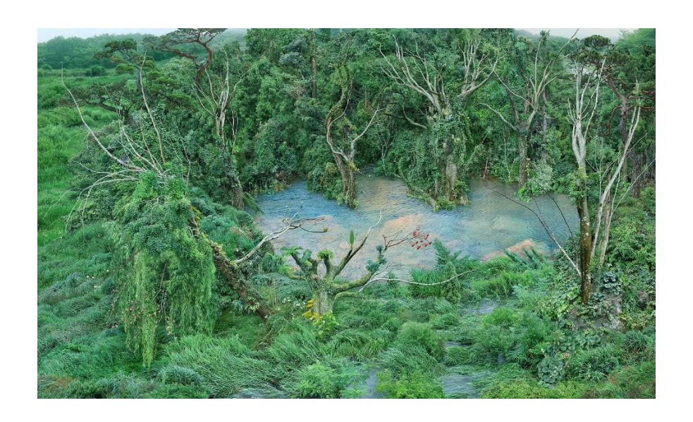
WON Seoung Won, Within the Reams of Possibilities, 2021, C-print, 172 x 287 cm