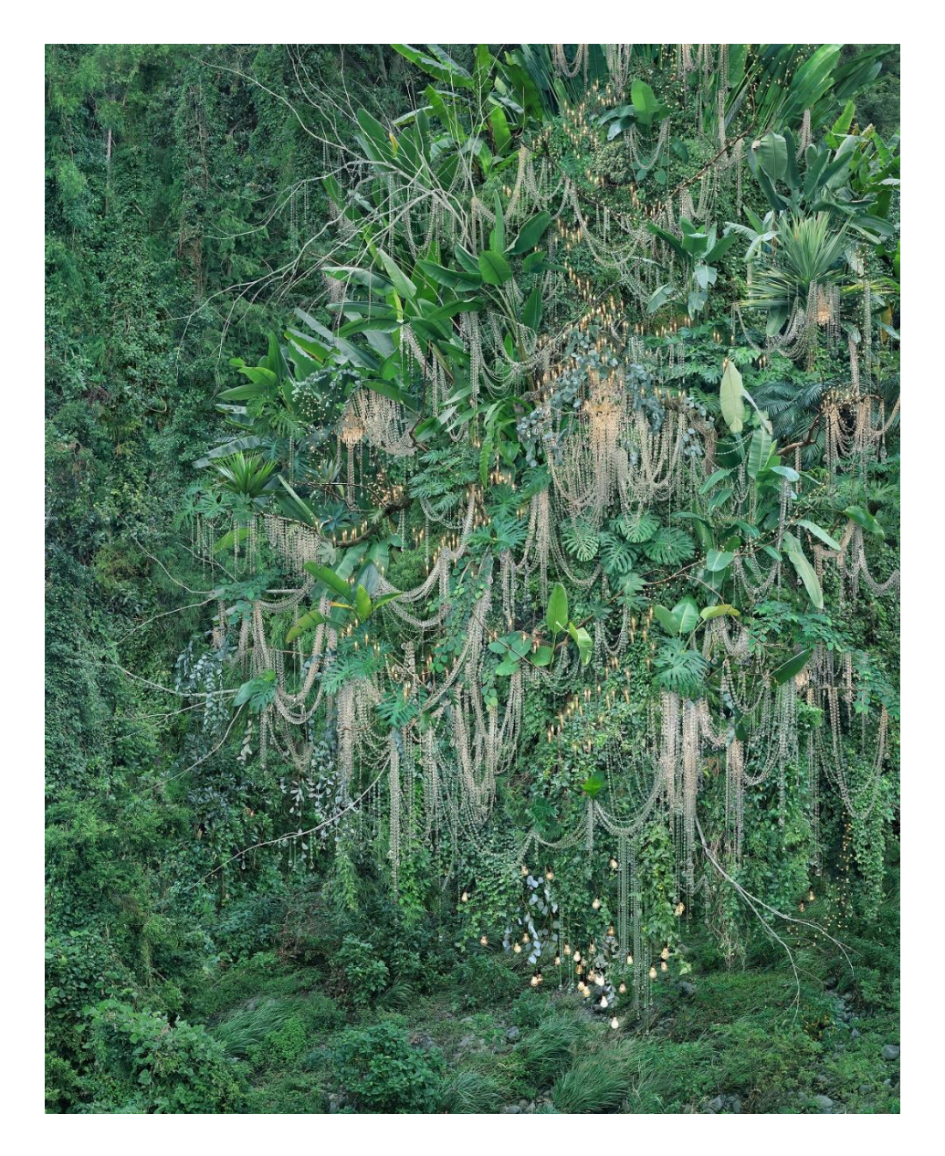
WON Seoung Won, Enduring Elegance, 2021, C-print, 222 x 178 cm