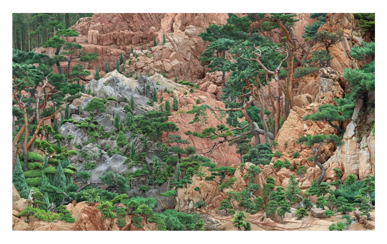
WON Seoung Won, Nurtured Childhood, 2021, C-print, 120 x 200 cm