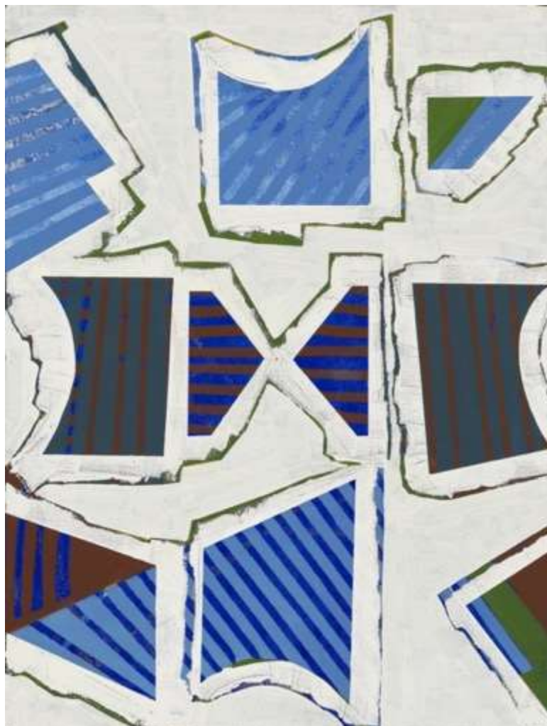
LIANG MANQI, Placement, Daily Life , 2022, Oil on canvas, 80 x 60cm