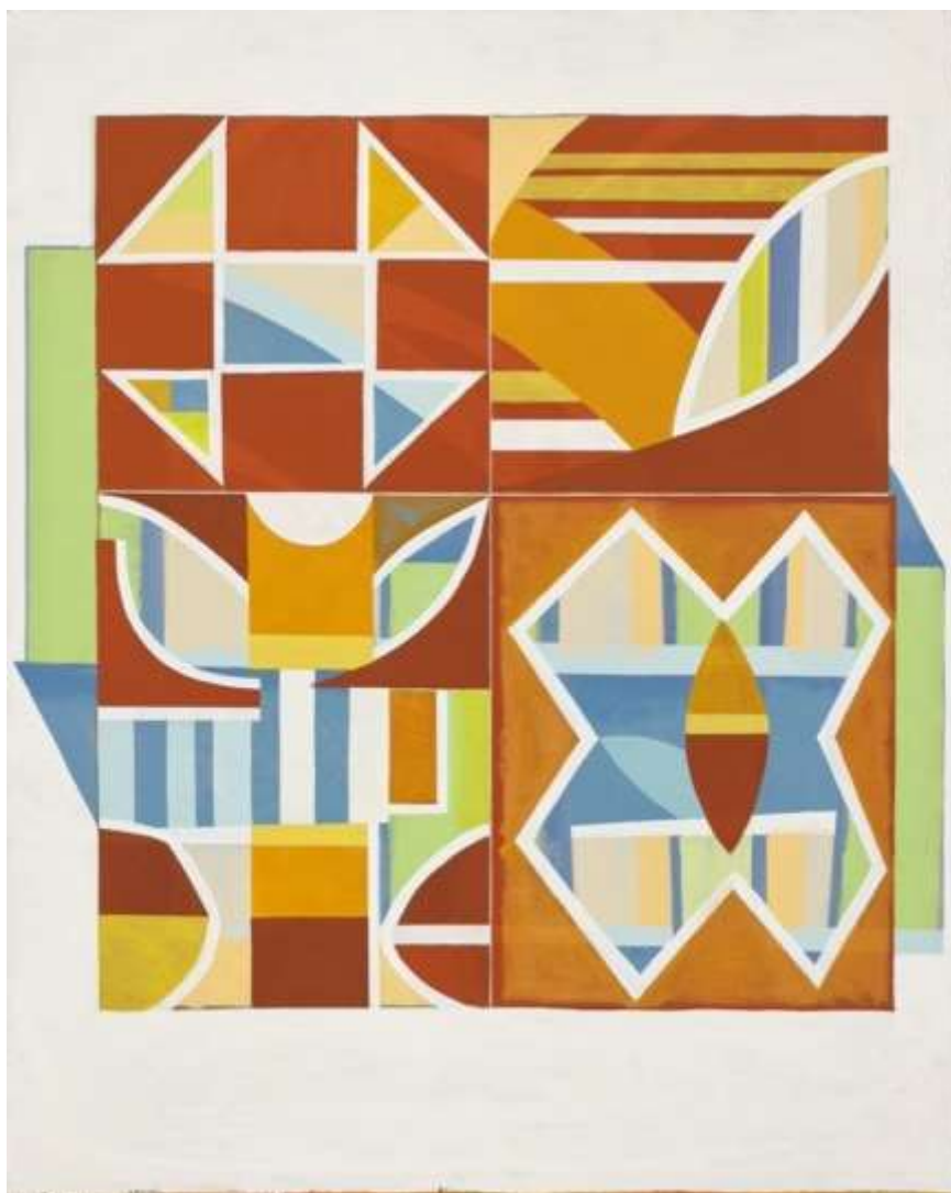
LIANG MANQI, Overlapping, Emotions, 2022, Oil on canvas, 150 x 120cm