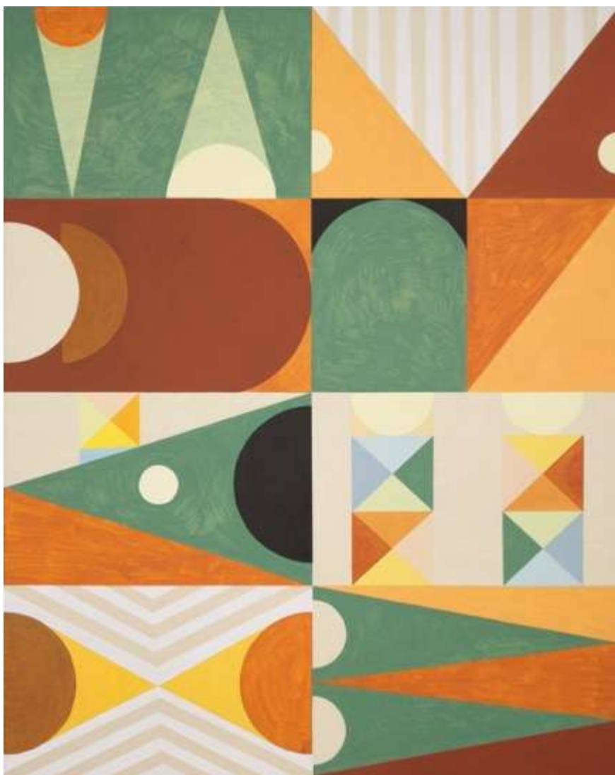
LIANG MANQI, Festival, Play , 2022, Oil on canvas, 200 x 160cm