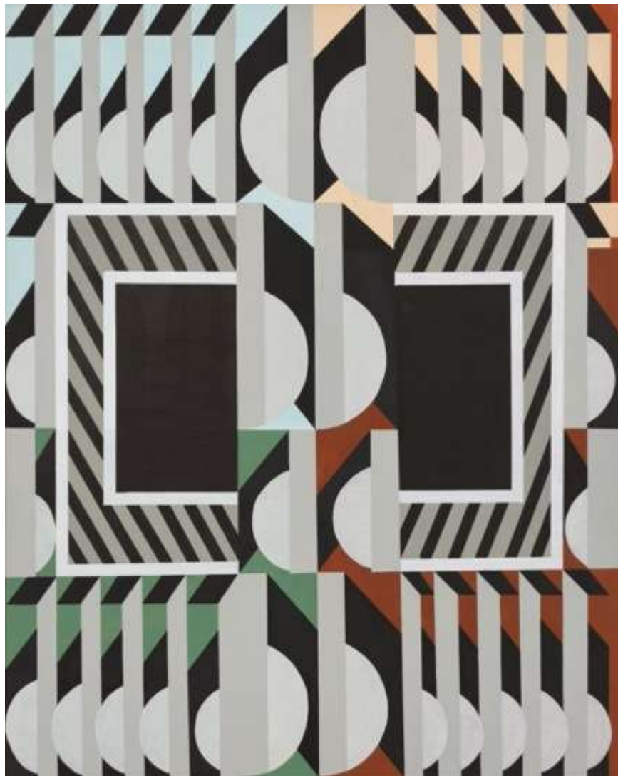
LIANG MANQI, Diffusion, Still, 2022, Oil on canvas, 150 x 120cm