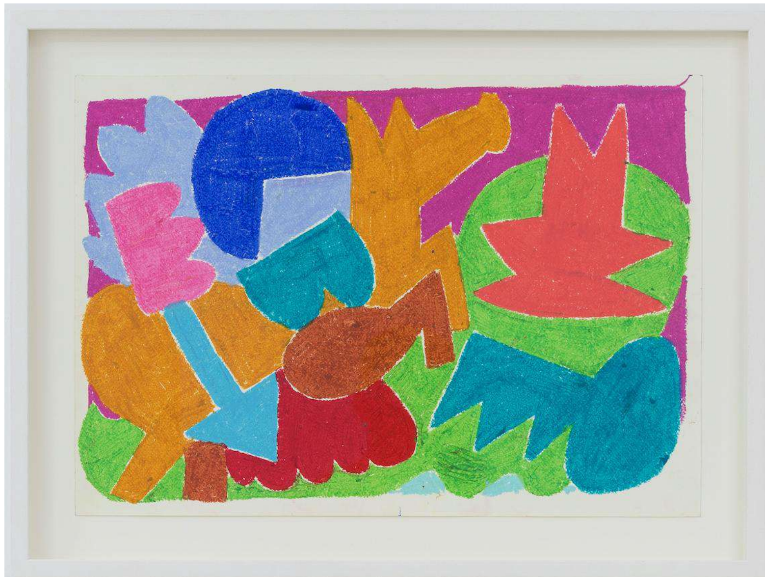
Aristeidis Lappas Woman Warrior , 2020 Oil pastel on paper Framed: 45 x 60 x 3 cm