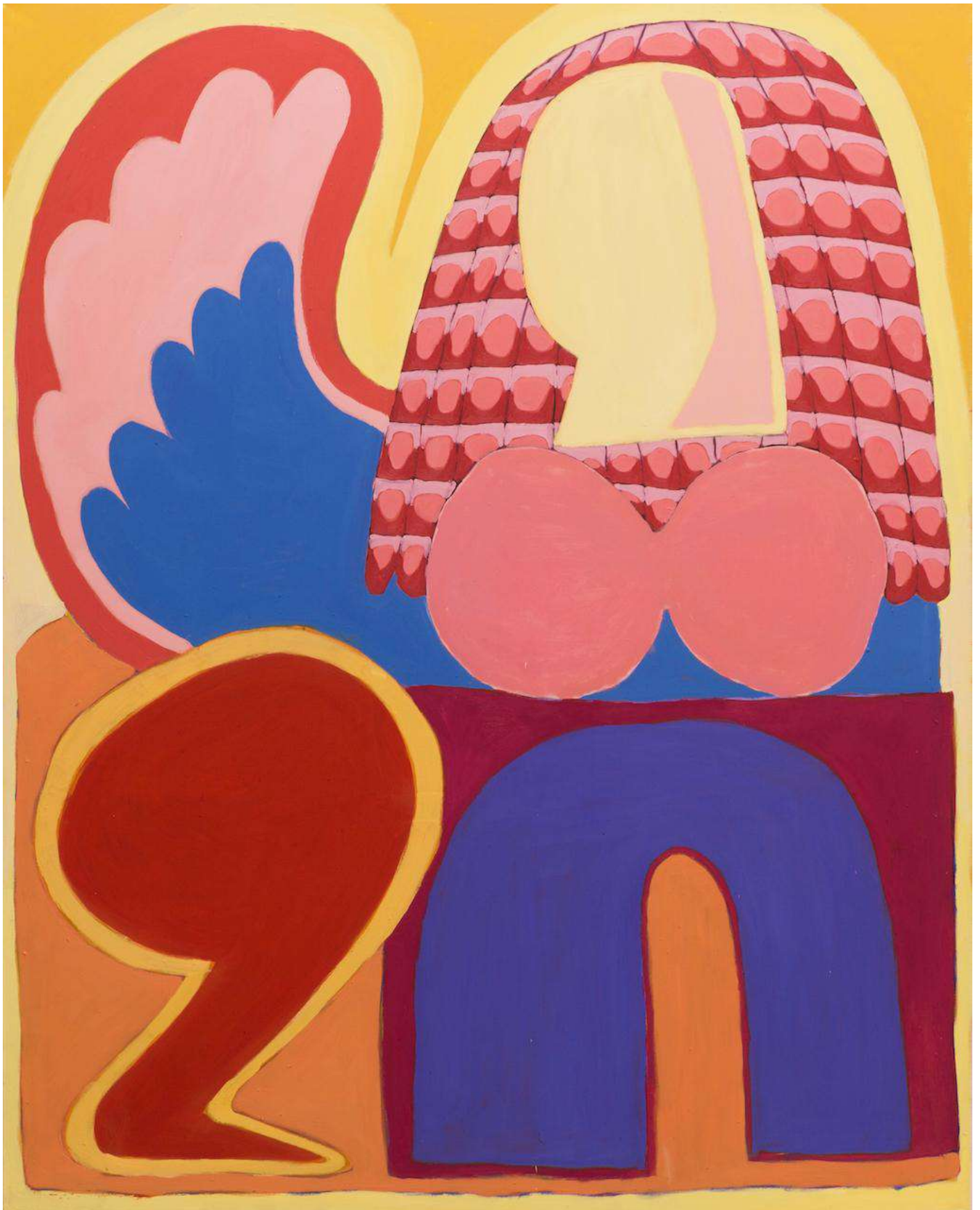
Aristeidis Lappas Sphynx , 2020 Oil and acrylic on canvas 200 x 160 cm