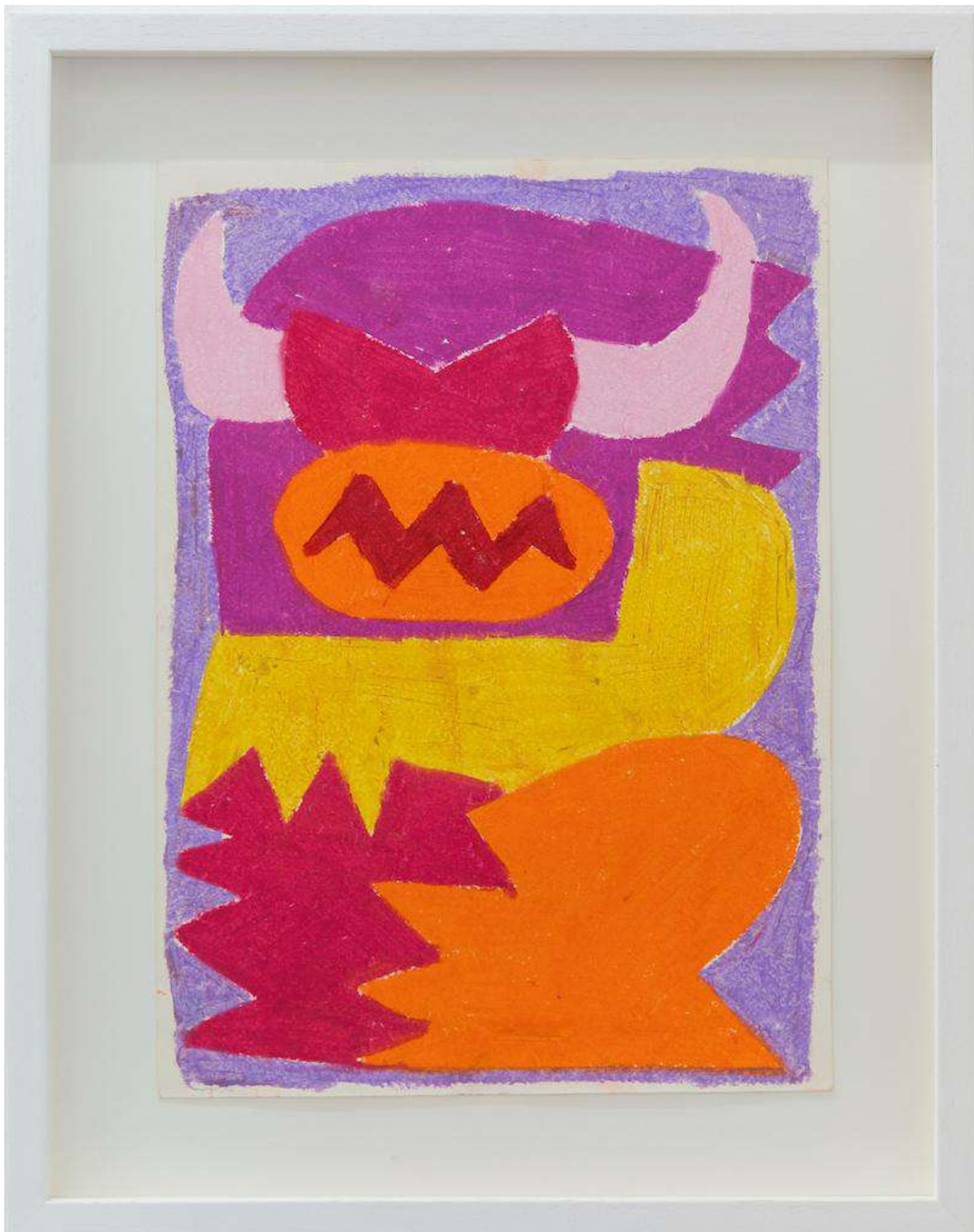
Aristeidis Lappas Little Monster II , 2020 Oil pastel on paper Framed: 45 x 36 x 3 cm