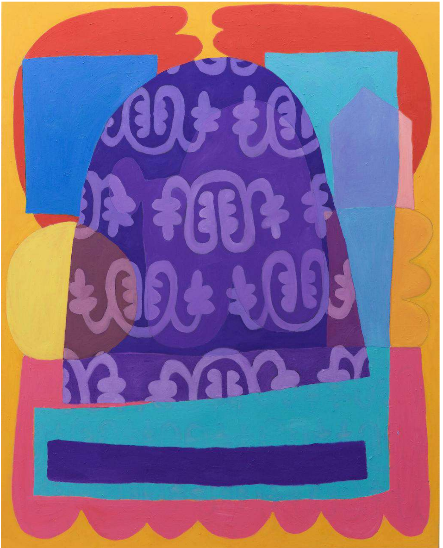
Aristeidis Lappas Goddess of Love and War , 2020 Oil and acrylic on canvas 200 x 160 cm