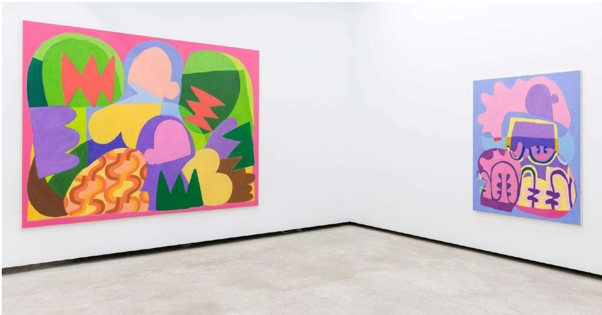
Aristeidis Lappas Tenderness of a Cutting Sword , 2020 Installation view at The Breeder, Athens