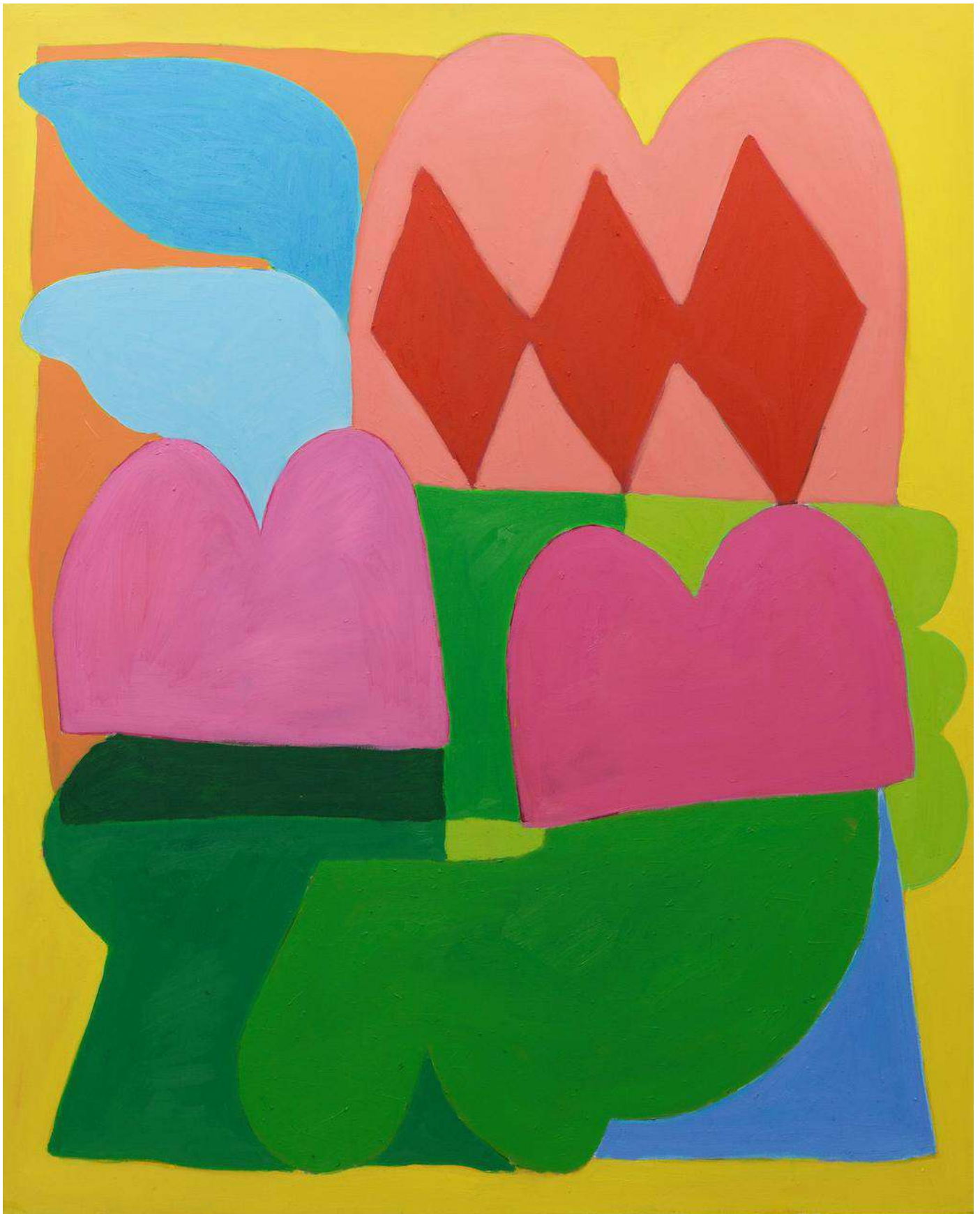
Aristeidis Lappas Boy Pipi Monster , 2020 Oil and acrylic on canvas 150 x 120 cm