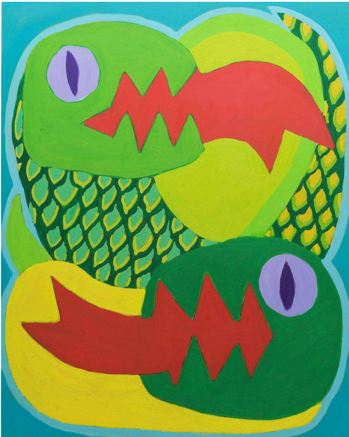
Aristeidis Lappas Snakes , 2020 Oil and acrylic on canvas 150 x 120 cm