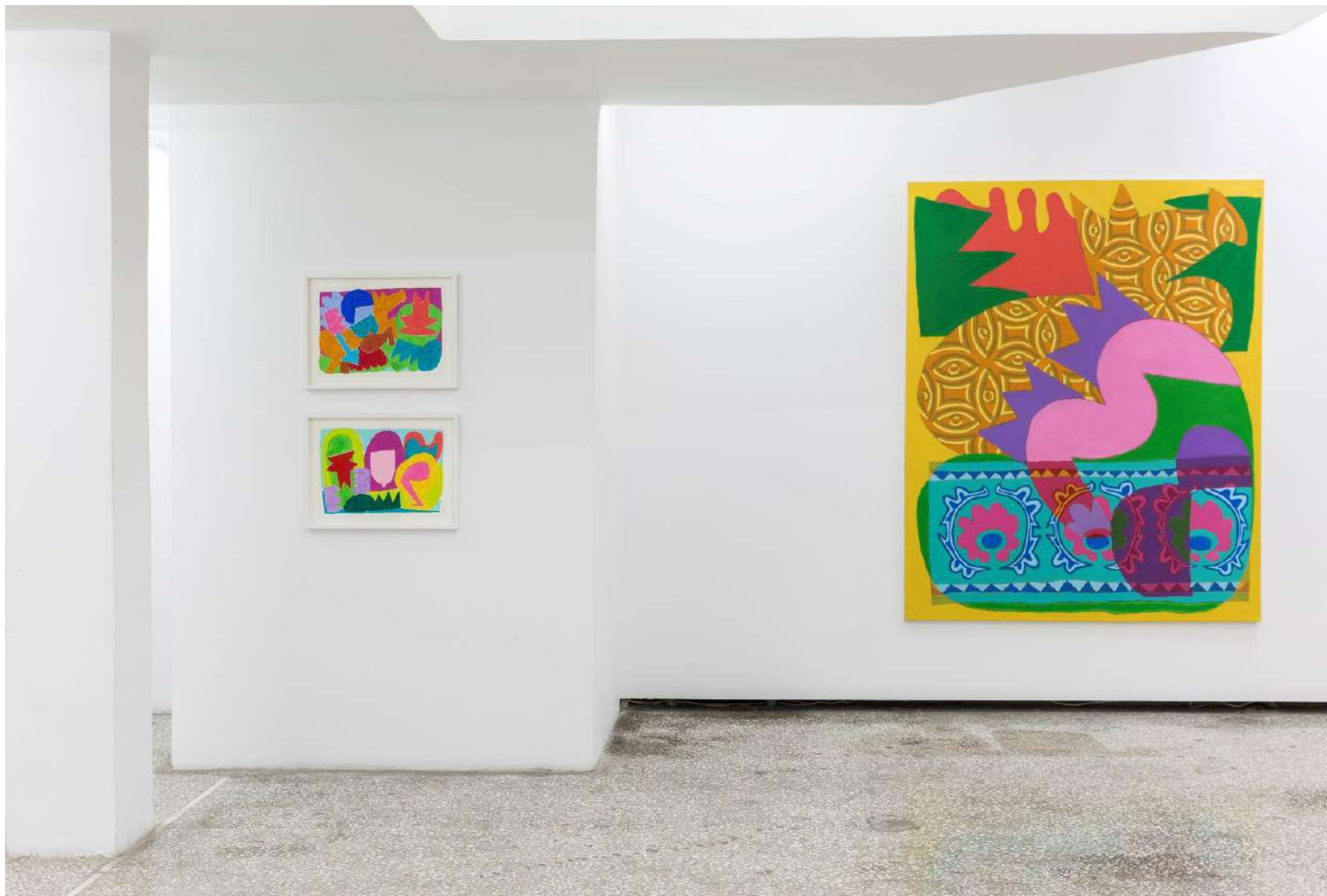
Aristeidis Lappas Tenderness of a Cutting Sword , 2020 Installation view at The Breeder, Athens