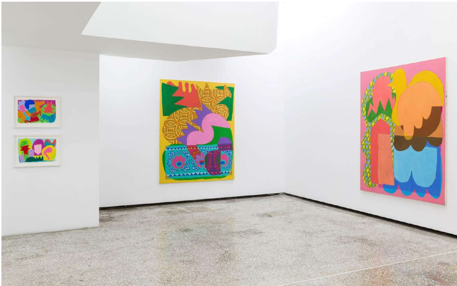
Aristeidis Lappas Tenderness of a Cutting Sword , 2020 Installation view at The Breeder, Athens