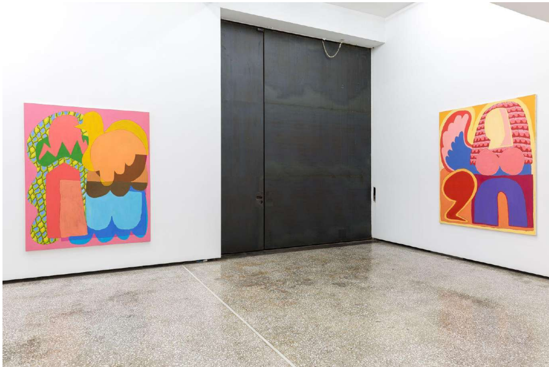
Aristeidis Lappas Tenderness of a Cutting Sword , 2020 Installation view at The Breeder, Athens