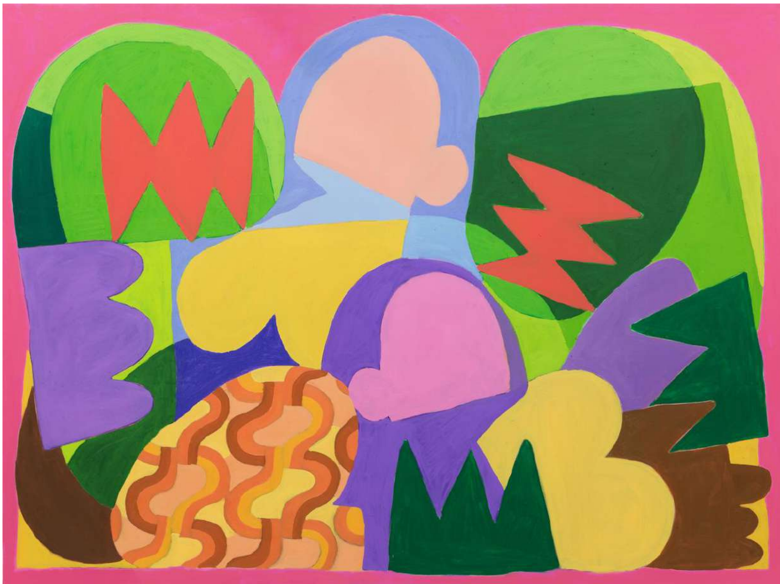
Aristeidis Lappas Loving the Beast , 2020 Oil and acrylic on canvas 200 x 270 cm