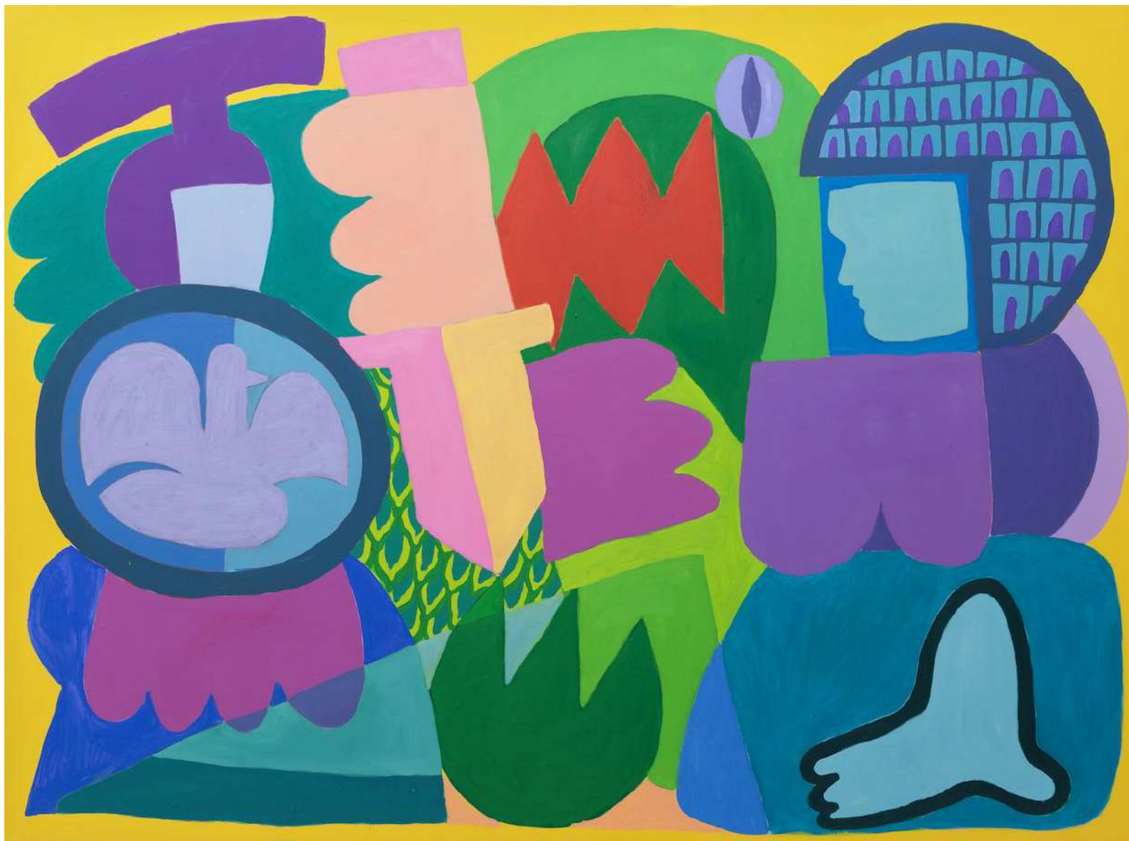
Aristeidis Lappas Athena and her Girl Kill the Beast , 2020 Oil and acrylic on canvas 200 x 270 cm