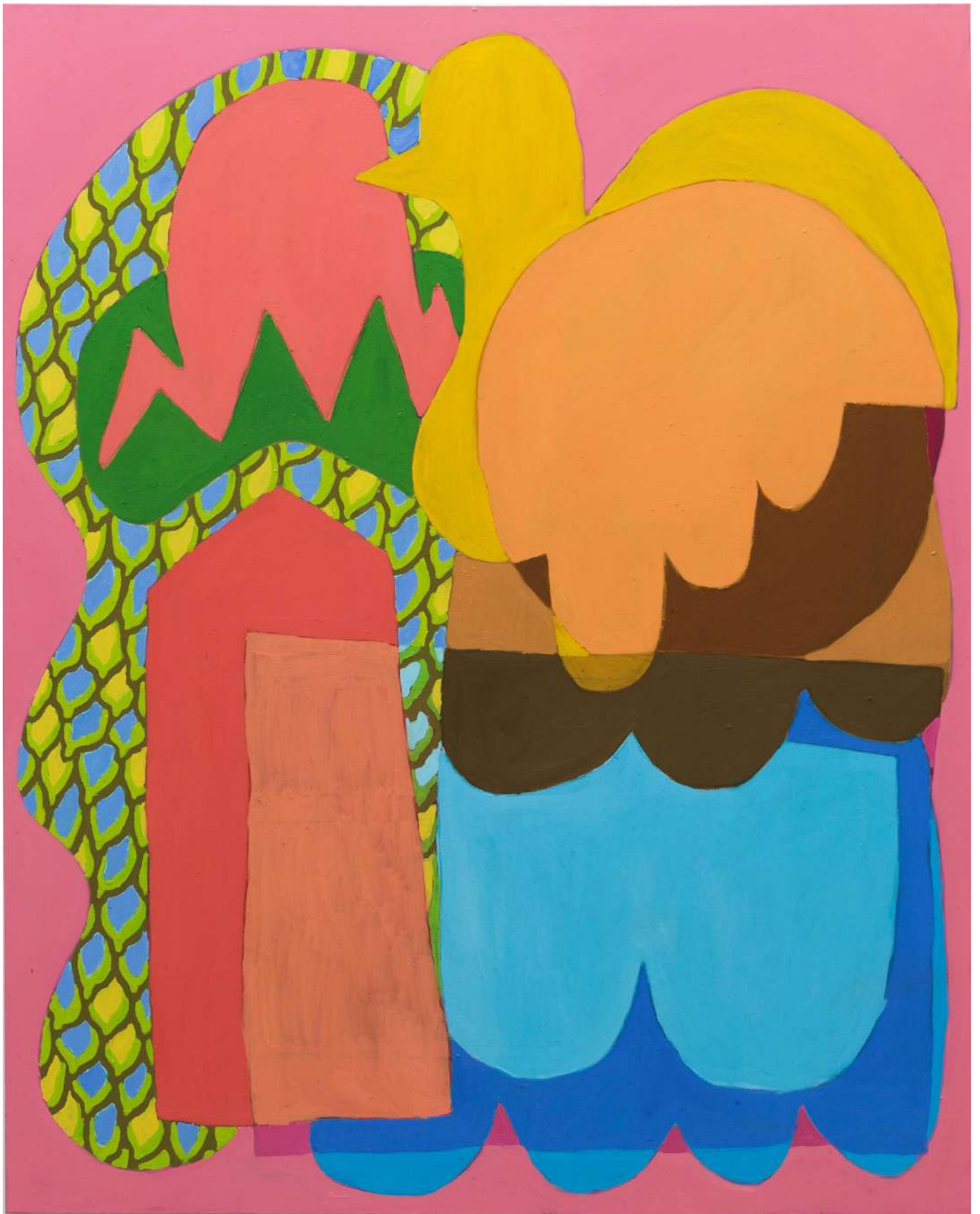
Aristeidis Lappas Death by Fair Hands , 2020 Oil and acrylic on canvas 200 x 160 cm