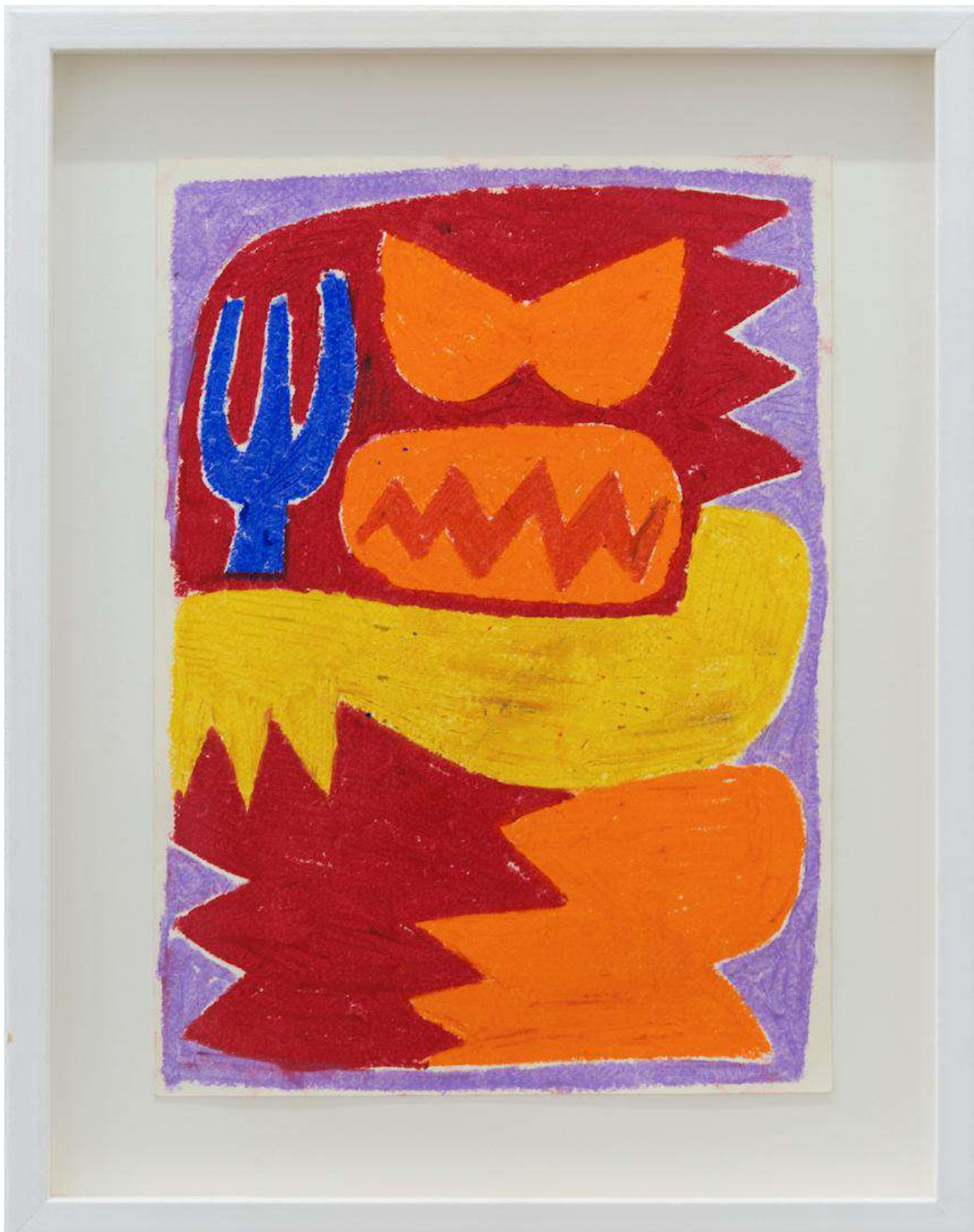
Aristeidis Lappas Little Monster I , 2020 Oil pastel on paper Framed: 45 x 36 x 3 cm