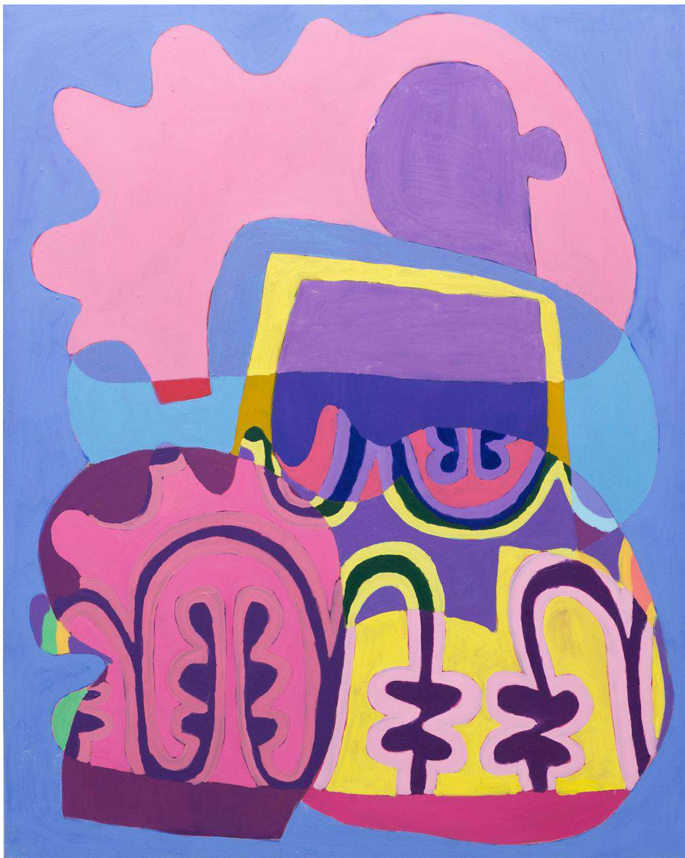
Aristeidis Lappas Atalanti , 2020 Oil and acrylic on canvas 150 x 120 cm