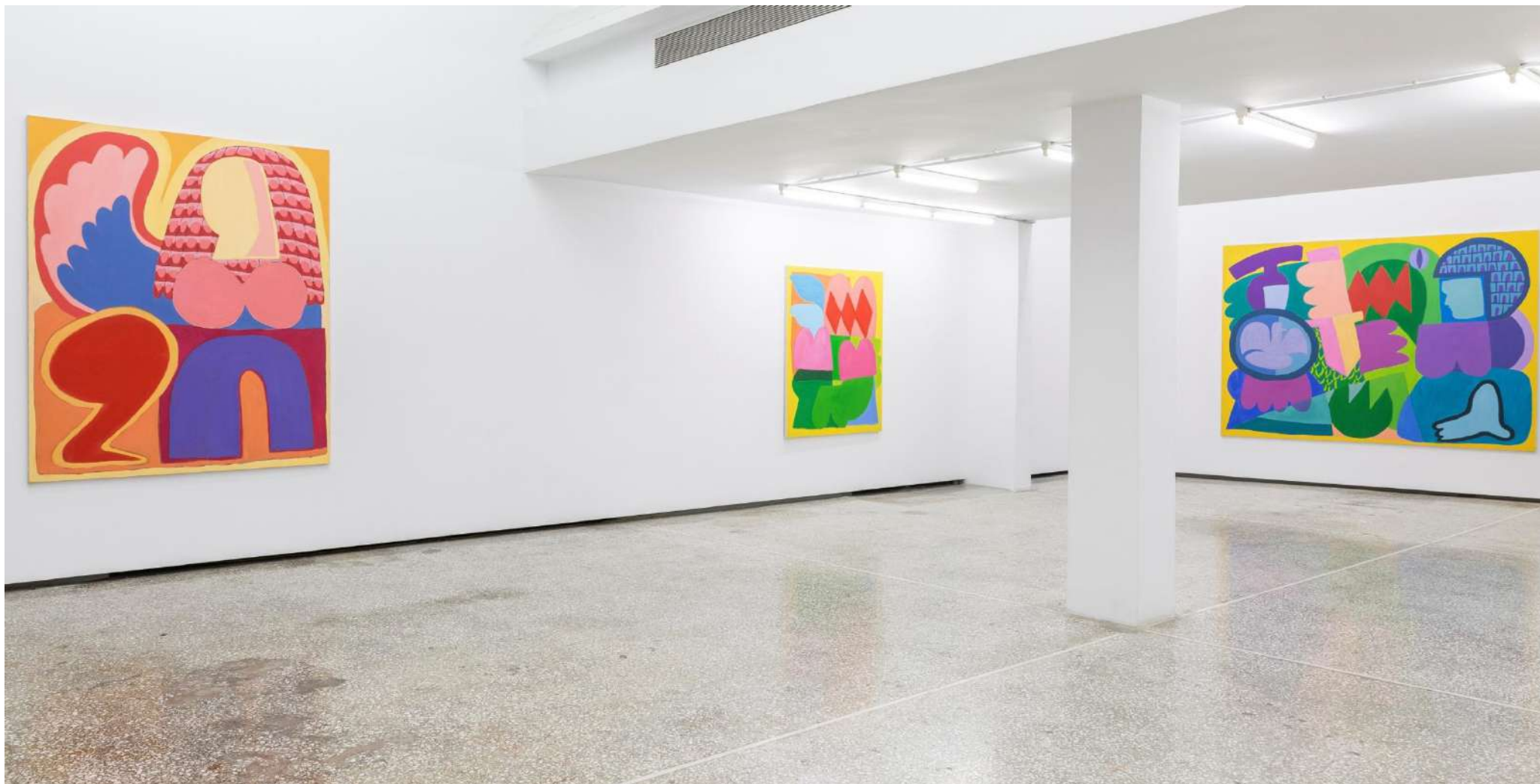
Aristeidis Lappas Tenderness of a Cutting Sword , 2020 Installation view at The Breeder, Athens