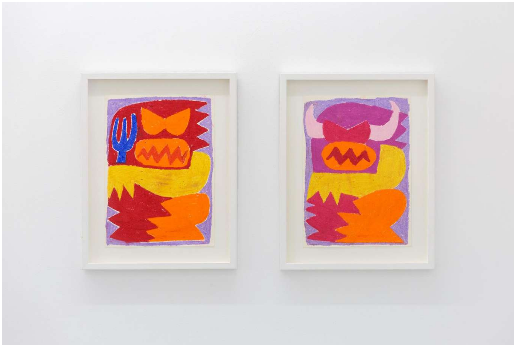
Aristeidis Lappas Tenderness of a Cutting Sword, 2020 Installation view at The Breeder, Athens