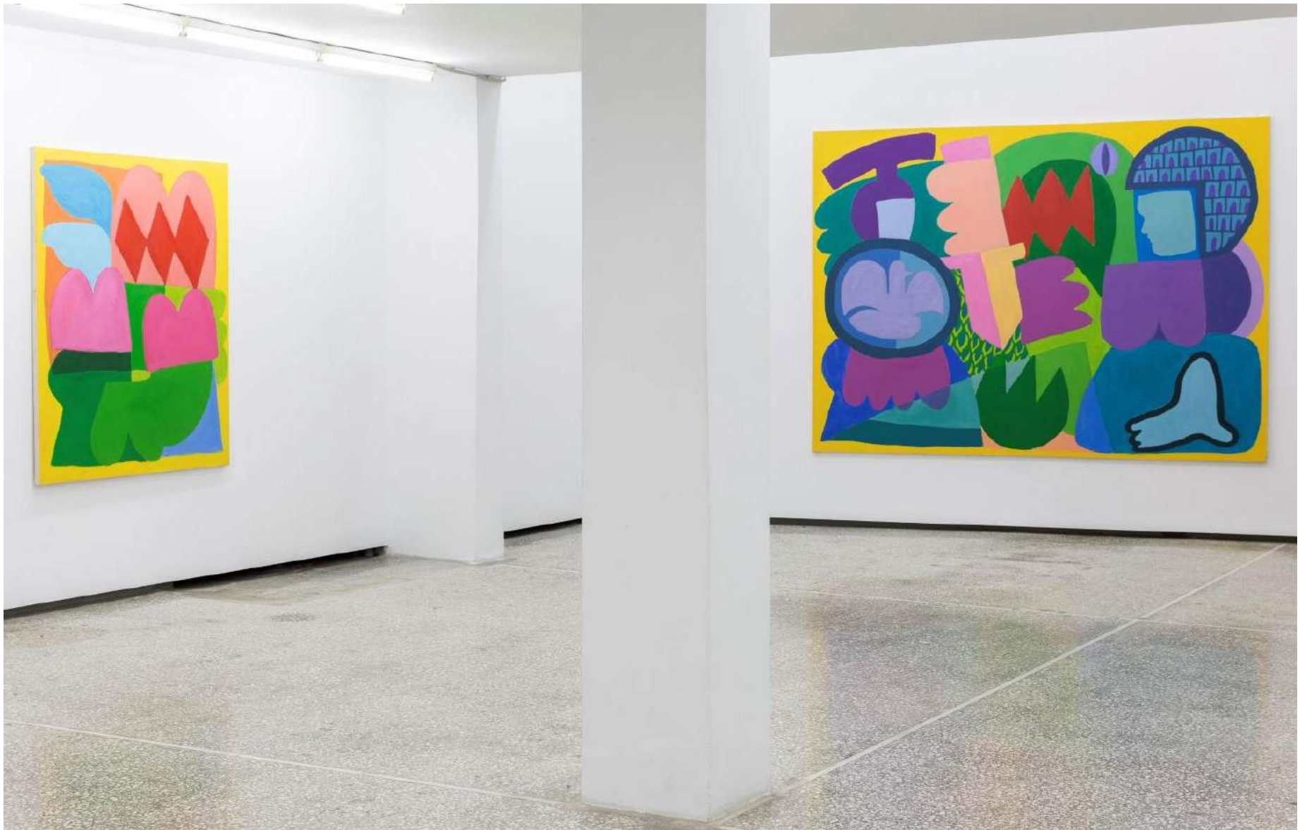
Aristeidis Lappas Tenderness of a Cutting Sword , 2020 Installation view at The Breeder, Athens