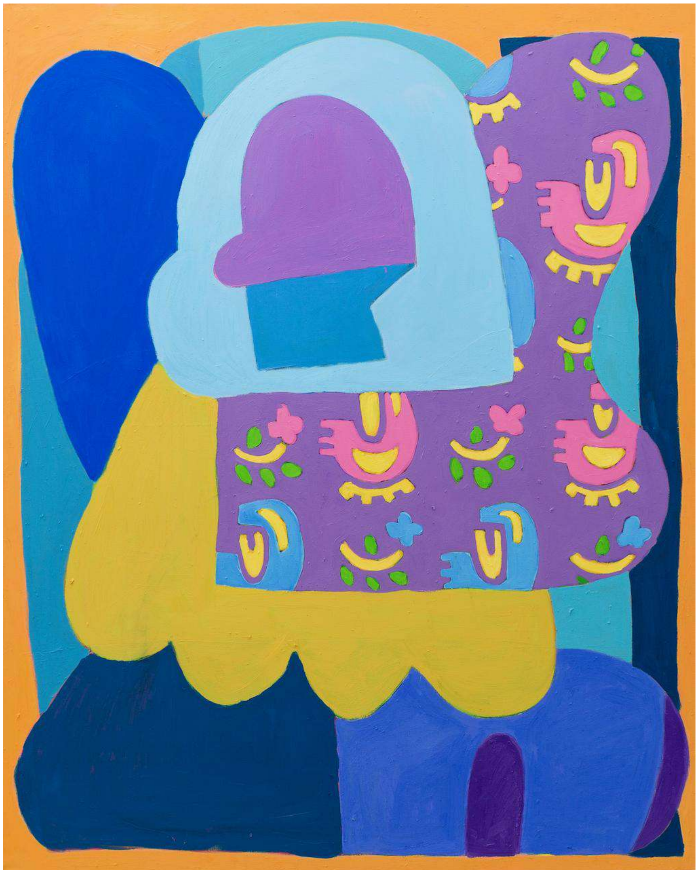
Aristeidis Lappas Circe , 2020 Oil and acrylic on canvas 150 x 120 cm