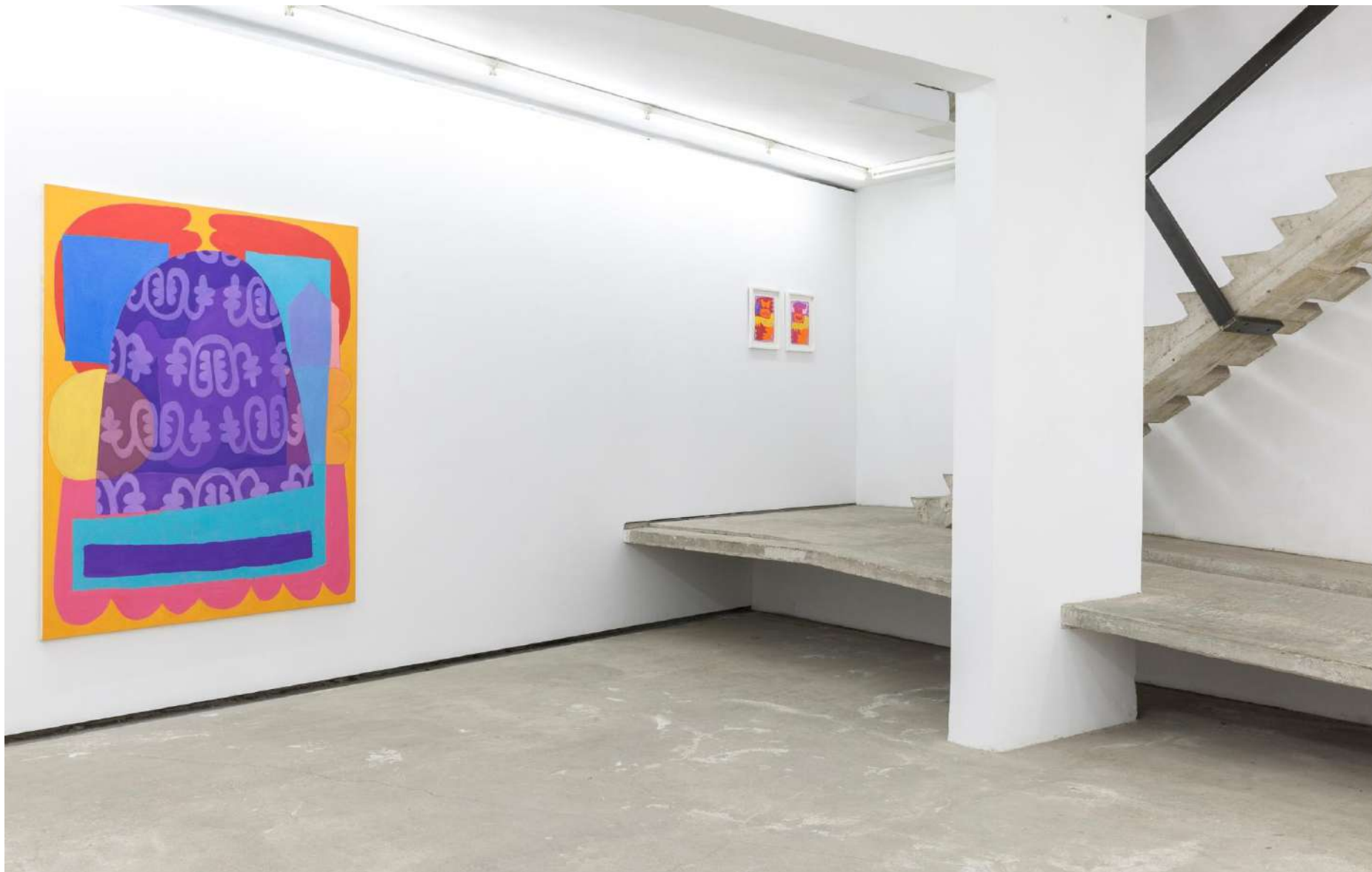
Aristeidis Lappas Tenderness of a Cutting Sword , 2020 Installation view at The Breeder, Athens