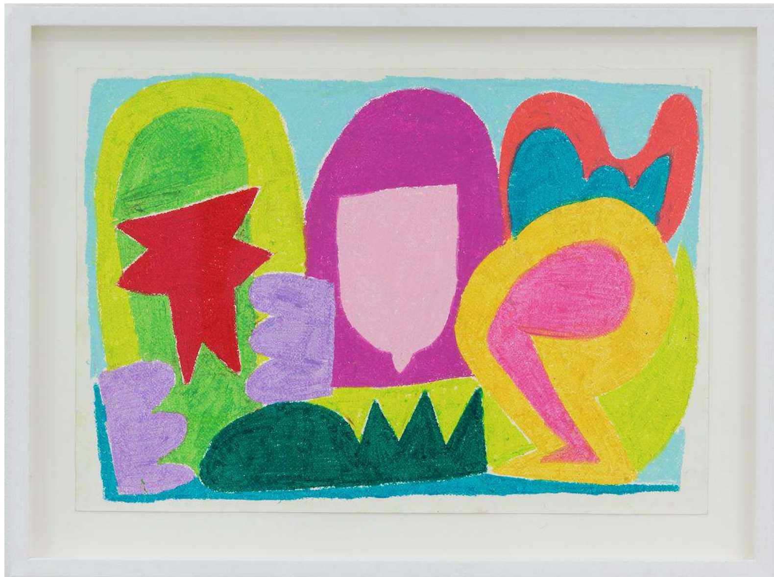
Aristeidis Lappas Wrestler Sphinx , 2020 Oil pastel on paper Framed: 45 x 60 x 3 cm