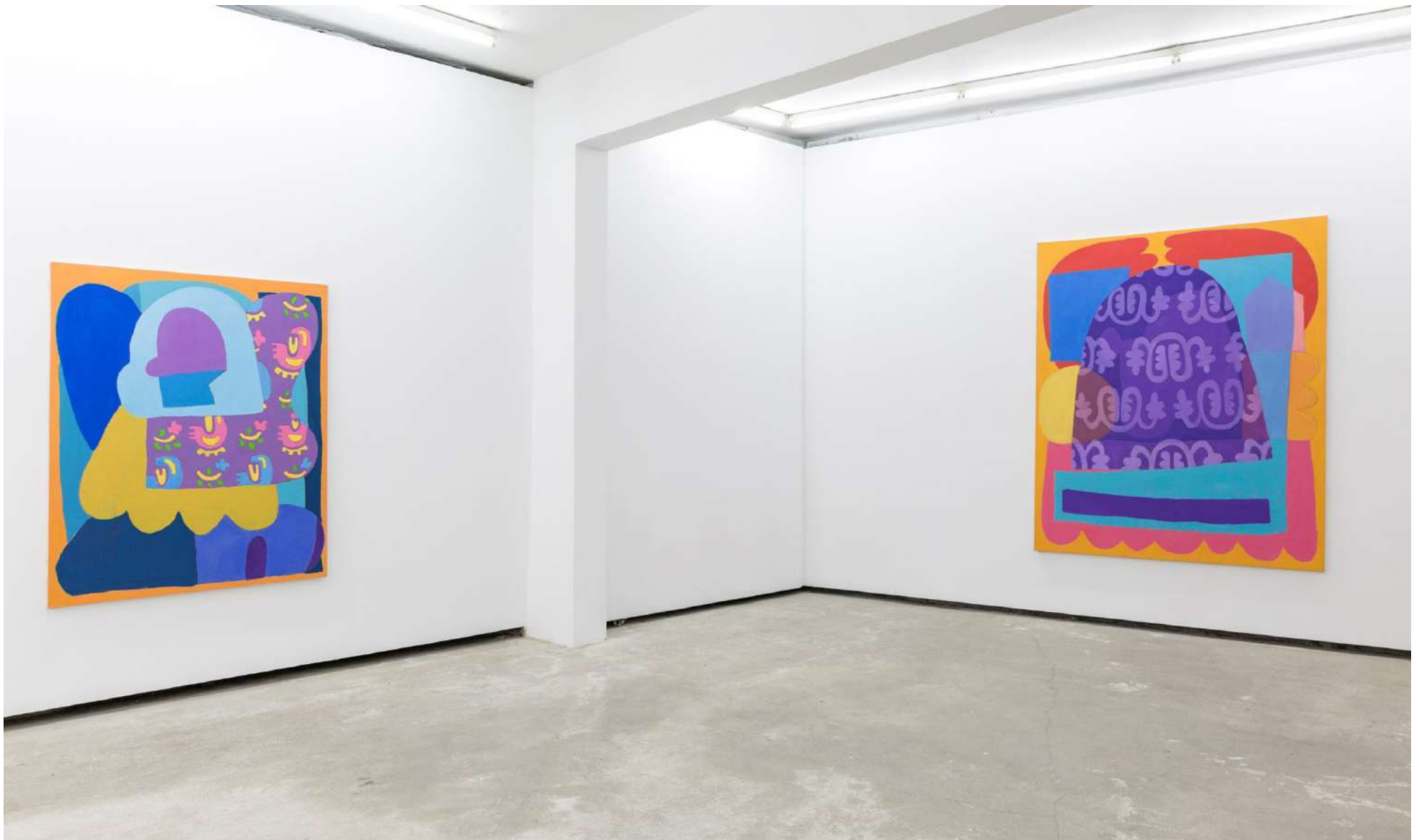
Aristeidis Lappas Tenderness of a Cutting Sword , 2020 Installation view at The Breeder, Athens