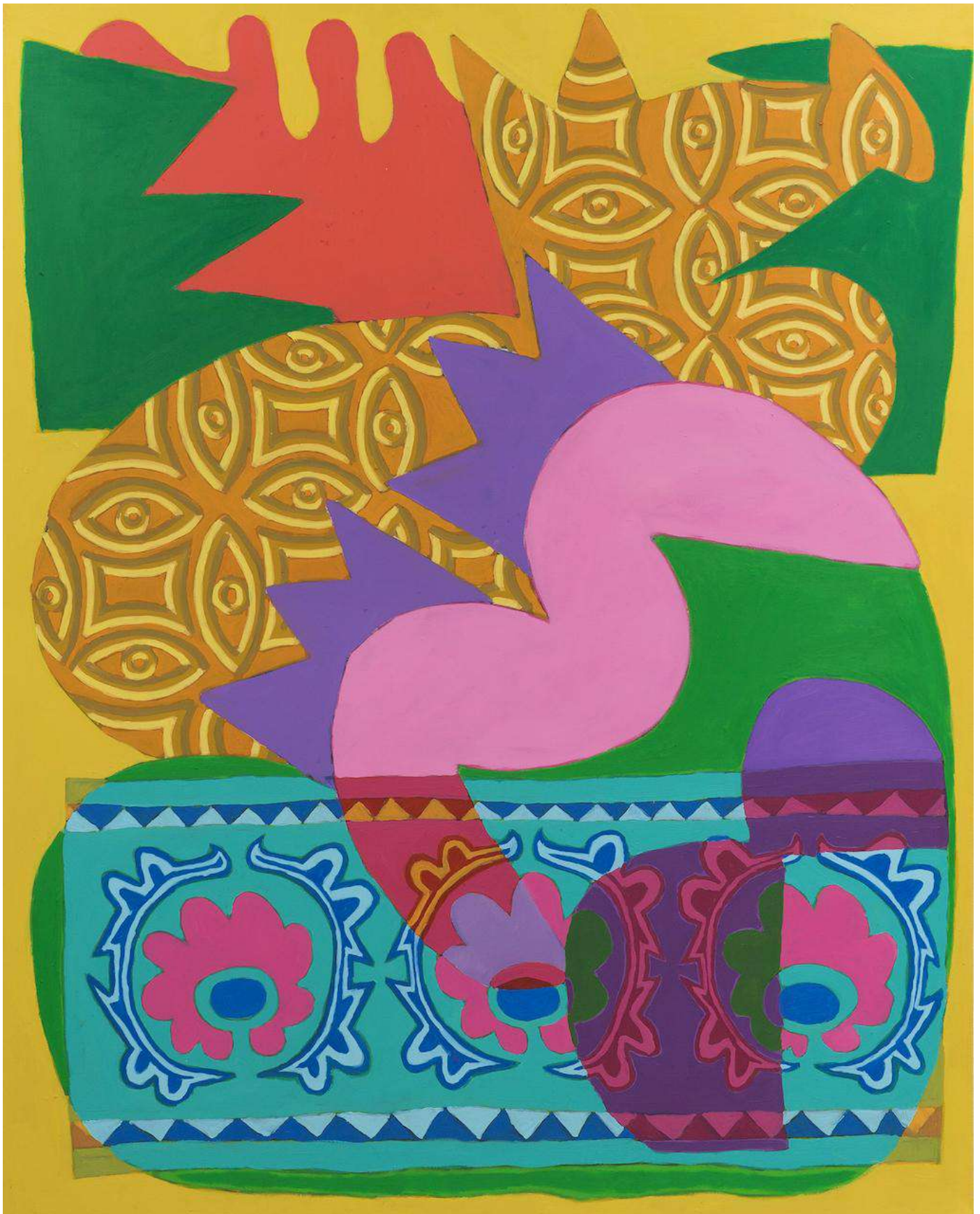
Aristeidis Lappas And the Dragon Ate St. Georges' Horse , 2020 Oil and acrylic on canvas 200 x 160 cm