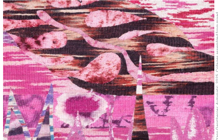
Yann Gerstberger, Automatic , 2025. Collages assembled from mixed fabric, glued onto tarpaulin and augmented with oil pastels. Courtesy of the artist and OMR, Mexico City. Photo by Davis Gerber © 2025.

Created in his studio on the Pacific coast of Mexico, these new works encompass Gerstberger's multi-faceted practice, including paintings and tapestries produced with an original technique conceived by the artist: he glues hand-dyed cotton fibers (originally from mops) on canvas to form colorful surfaces. Inspired by patterns found in Mexican popular culture, art history and nature, the artist blurs the boundaries of abstraction and figuration, traditional techniques and mass-consumption products, suggesting craftsmanship as a possible continuation of the modernist pictorial project.