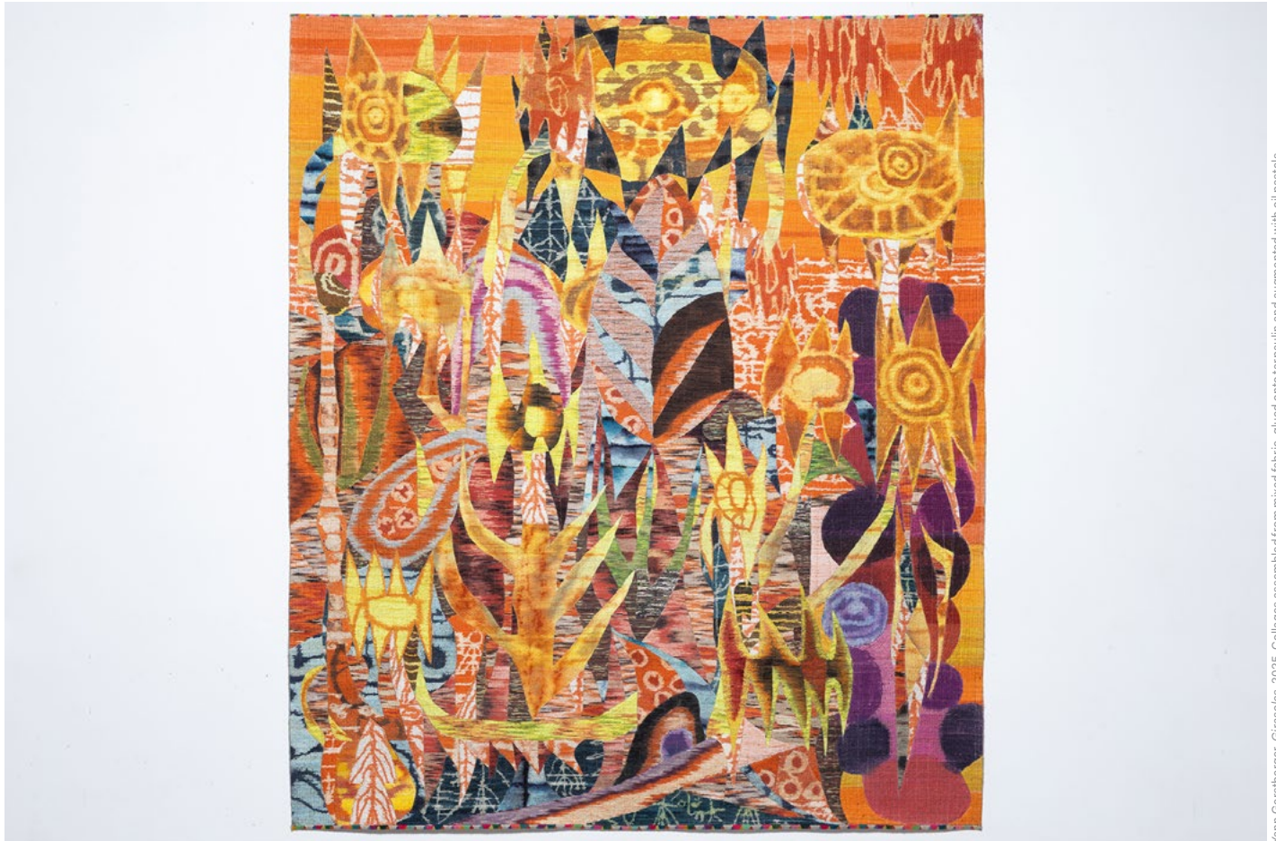
Yann Gerstberger, Girasoles , 2025. Collages assembled from mixed fabric, glued onto tarpaulin and augmented with oil pastels.

OMR IS PLEASED TO ANNOUNCE 2 FEET IN 1 BUCKET OF ICE , FRENCH ARTIST YANN GERSTBERGER'S SECOND SOLO EXHIBITION WITH THE GALLERY