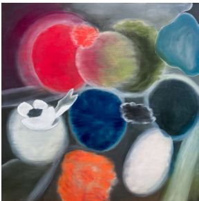
Ross Bleckner One Figure Away , 2024 oil on linen 152.6 x 152.6 x 4.5 cm | 60 x 60 in DOWNLOAD THE HR PICTURES

© Donald Baechler, courtesy of Maruani Mercier, Belgium