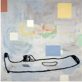
Donald Baechler Abstract Painting with Spaceship , 1986 acrylic and fabric collage on canvas 190.5 x 190.5 cm | 75 x 75 in DOWNLOAD THE HR PICTURES

August 2 - September 7, 2025 Kustlaan 90, 8300 Knokke