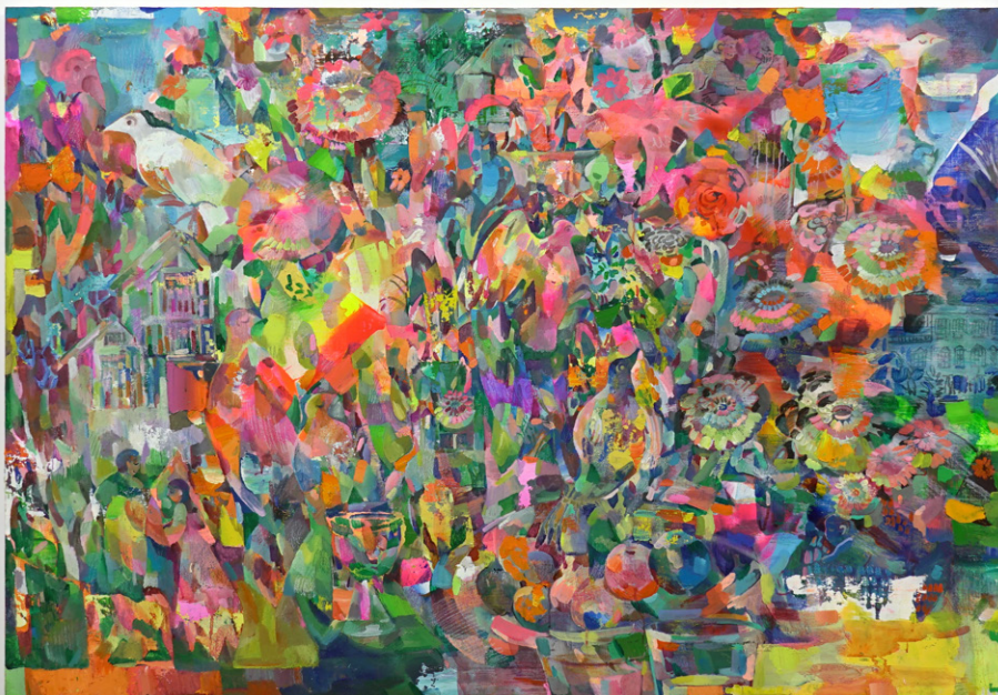
pink bird , 2025

From canvases richly layered with paint to drawings rendered with delicate lines, Yamamoto's works emerge through a dynamic interplay of diverse elements. Viewers are encouraged to navigate these disparate fragments and overlapping textures, tracing a visual narrative as one would a map unfolding before them. Immersed in moments where light and darkness intertwine, the artist's eclectic creations invite us to pause and explore this complicated world we all live in.