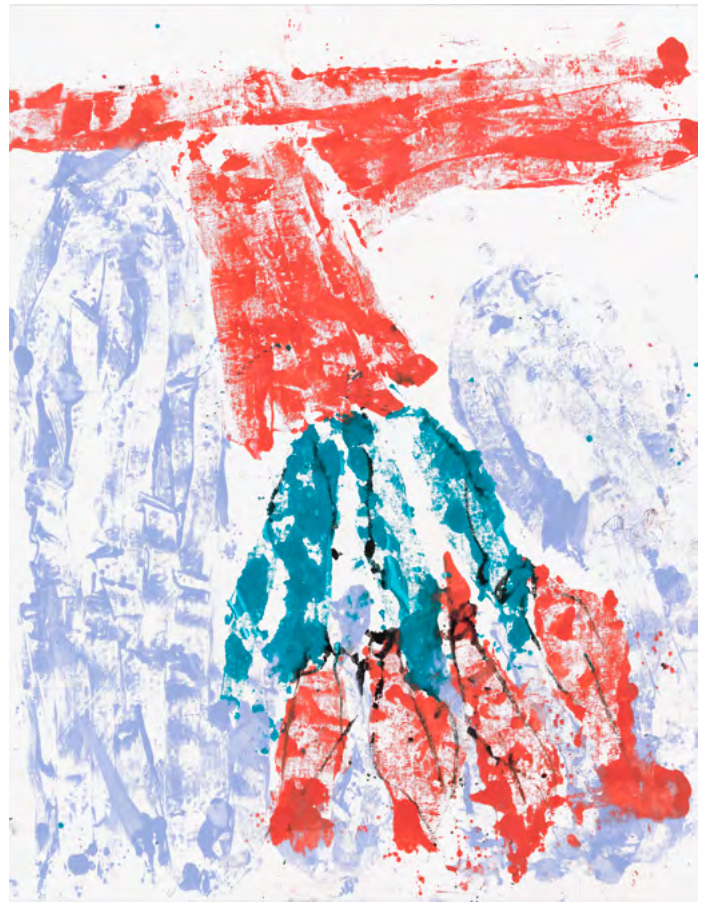
Georg Baselitz, Wenn Piet im Lande geblieben wär , 2020 Oil on canvas. 300 x 230 cm (118.11 x 90.55 in)

La boussole indique le nord will be accompanied by an exhibition catalogue with a text by Philippe Dagen.