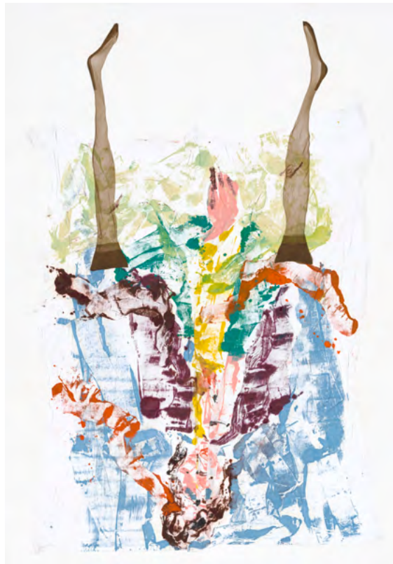
Georg Baselitz, Der Kompass zeigt nach Norden , 2021 Oil, dispersion adhesive, fabric and nylon stockings on canvas 300 x 210 cm (118.11 x 82.68 in)

Thaddaeus Ropac Paris Pantin 69, avenue Général Leclerc, 93500 Pantin