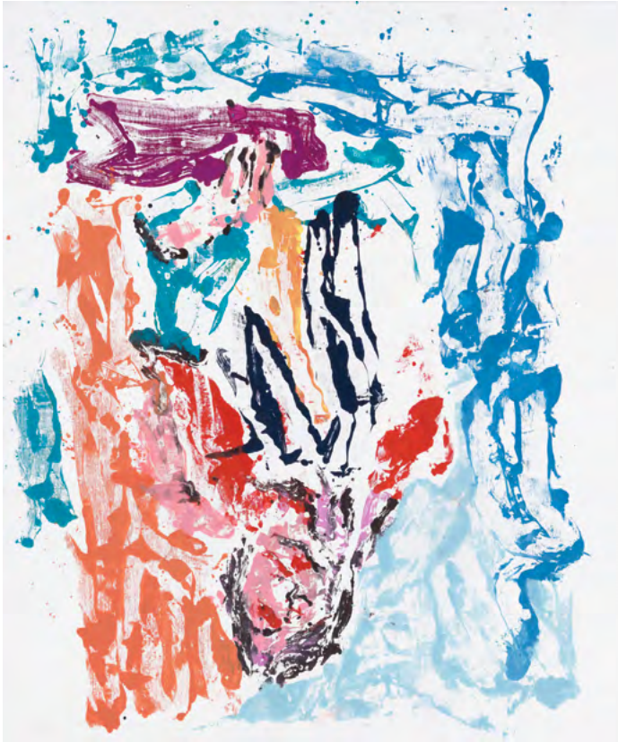
Georg Baselitz, Menti senti , 2020 Oil on canvas. 300 x 250 cm (118.11 x 98.43 in)