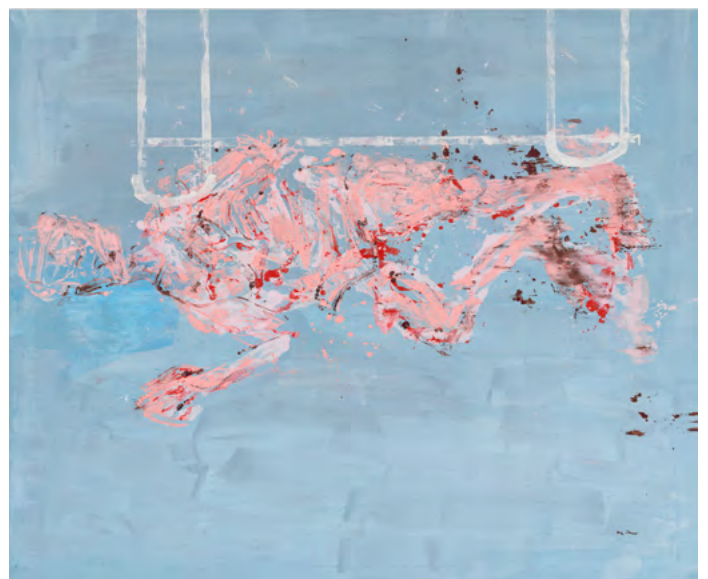
Georg Baselitz, Wirft die Frau den Stein? I , 2020 Oil on canvas. 250 x 300 cm (98.43 x 118.11 in)

Baselitz takes his monotype technique a step further in his intensely chromatic portraits with stockings, transferring the figure of Elke onto a piece of fabric which he then affixes to the canvas. Allowing the