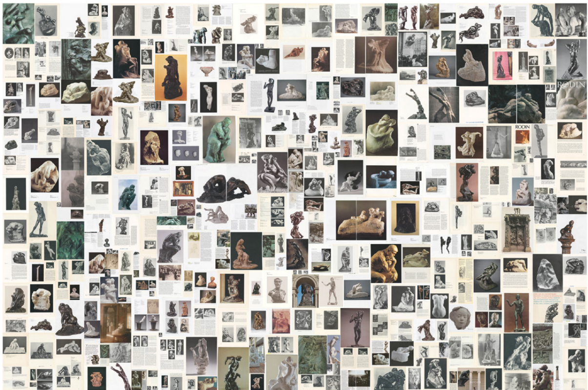
Background Materials (Rodin) , 2025 Wallpaper, 457.0 x 305.0 cm

Mungo Thomson has had recent solo exhibitions at the Walker Art Center, Minneapolis; The Aspen Art Museum; and Karma, New York and Los Angeles; and group exhibitions at MUDAM Luxembourg; The Museum of Fine Arts, Houston; and the Orange County Museum of Art. He has been included in Pacific Standard Time, the Istanbul Biennial, The Whitney Biennial, The Performa Biennial, and the Biennial of the Moving Image. Thomson’s work is held in the public collections of Museo Jumex, México City; FRAC Île-de-France, Paris; Museum of Contemporary Art, Los Angeles; Berkeley Art Museum and Pacific Film Archive, Berkeley; Hirshhorn Museum and Sculpture Garden, Washington, D.C.; Walker Art Center, Minneapolis; Museum of Fine Arts, Houston; Pérez Art Museum, Miami; and the Whitney Museum of American Art, New York. Thomson’s work was featured in the 2025 New York Film Festival, and he is the recipient of a 2025 Guggenheim Fellowship.