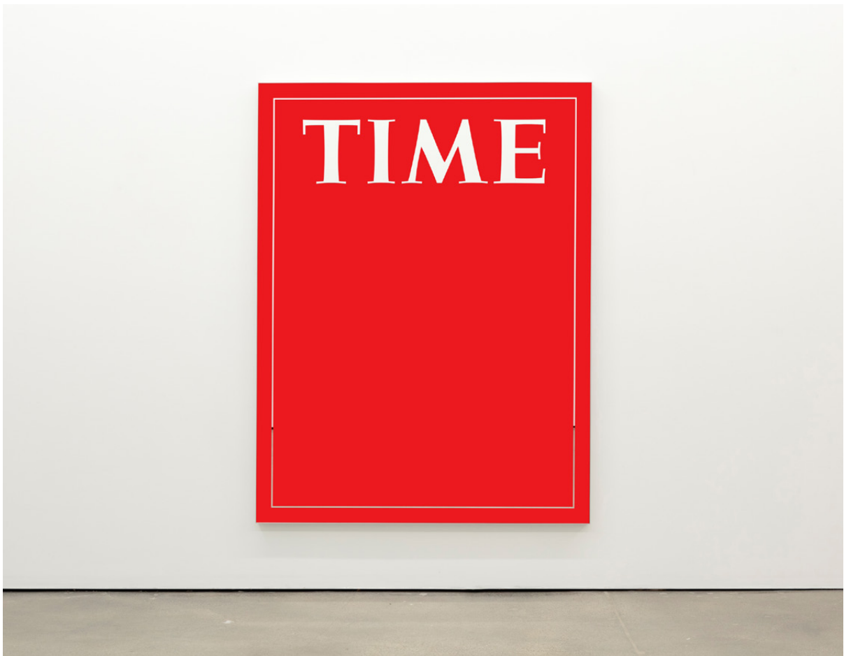
June 19, 1972 (The Occult Revival), 2025

Enamel on low-iron mirror, poplar, and aluminum, 188.0 x 142.0 x 6.5 cm