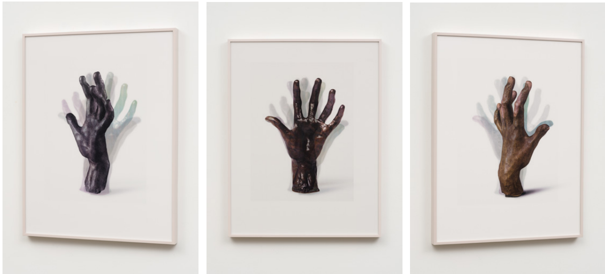
Hand of a Pianist, 2025

Lenticular print in artist's frame, 100.8 x 77.9 x 5.1 cm