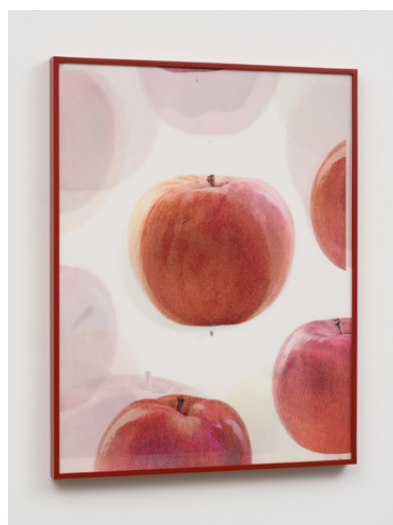
Big American Apples , 2025

Lenticular print in artist's frame, 100.8 x 77.9 x 5.1 cm