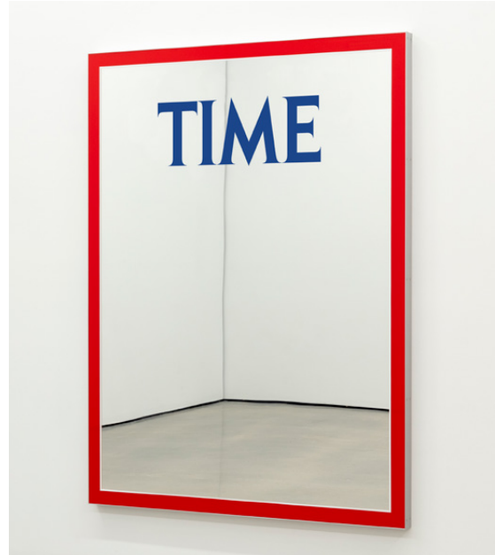
July 3, 1989 (The Sun) , 2025

Born in 1969 in Woodland, CA and currently based in Los Angeles, Mungo Thomson is known for a diverse body of conceptual work that challenges everyday perceptions and conventions through film, sound, sculpture, installation, and other media. Often engaging with printed and archival materials such as magazines, advertisements, wall calendars, and cardboard delivery boxes, his ambitious practice incisively yet playfully dissects the anatomy of mass-media and consumerism while examining their effects on our collective existence through a cosmic lens.