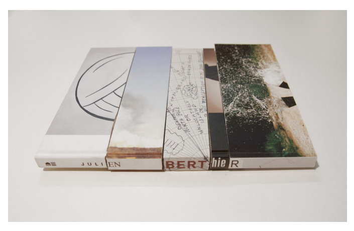
Les Monographies, 2018