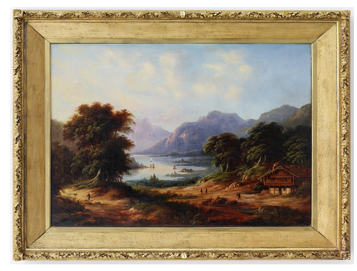
5 secondes plus tard (après Achille), 2017

In a quite different way, Les Chutes (2018), a new series of wall-mounted sculptures, also sees Berthier revisit his earlier projects. These sculptures may seem abstract but each in fact takes its form from a by-product of one of Berthier's earlier works, produced over the past decade or so. Some started life in order to test ideas; some were model pedestals for realised sculptures; others were simply off-cuts from the process of production - a cross-section here, a sliced-off corner there. Something drew Berthier to each form and they remained in his awaiting rediscovery. studio Now, he has scaled them up to a human scale - like masks, he points out - making use of the