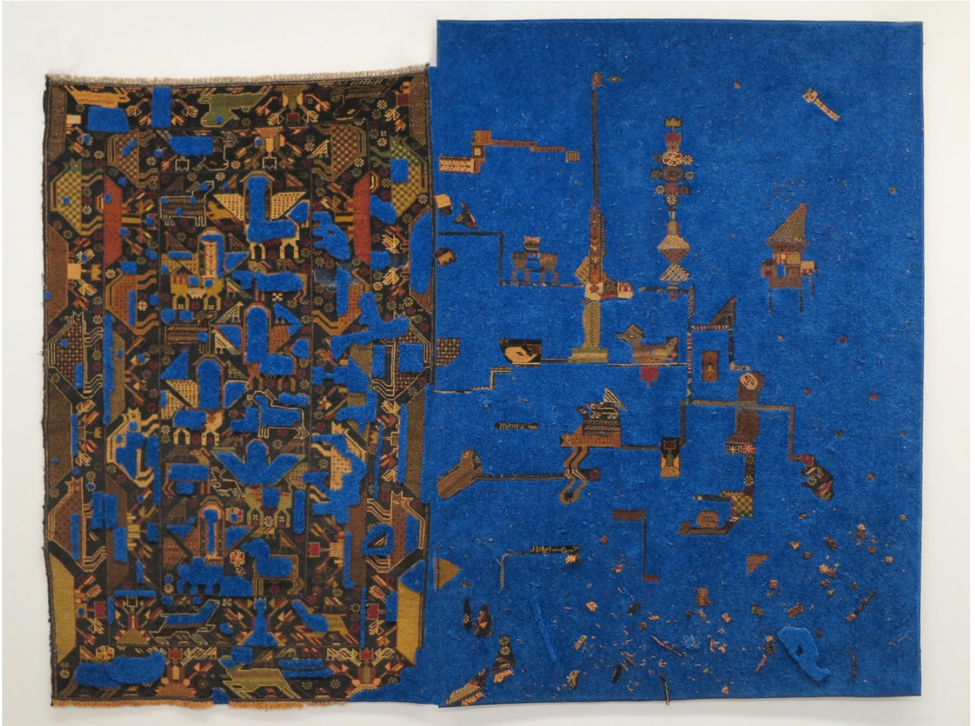
Hand-knotted wool Afghan rug, machine-woven polypropylene rug, felt, adhesive 84 x 108 inches 274.3 x 213.4 cm (am-p-03)