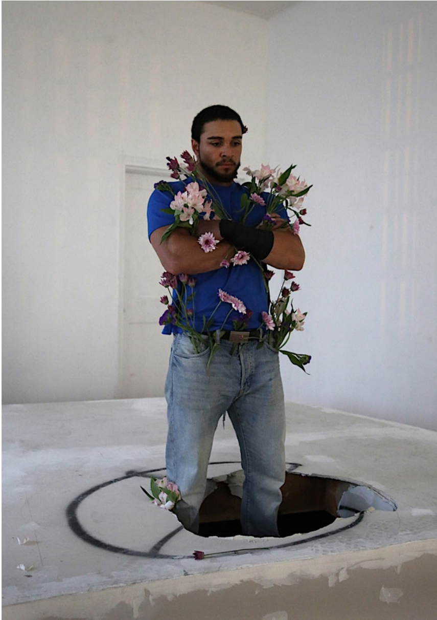
Archival Inkjet print on Cotton Canson Platine paper (unique) 23 1/2 x 14 inches 59.7 x 35.6 cm (am-p-02)