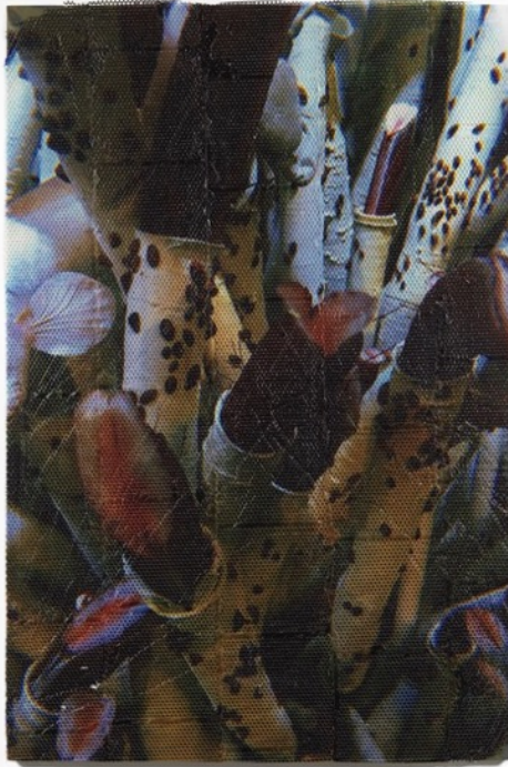
Natural History, 2019

gesso, acrylic polymer, acrylic medium, screen printing ink. UV-cured inkjet print, digitally printed resin on canvas over dibond panel, 203 x 135 cm