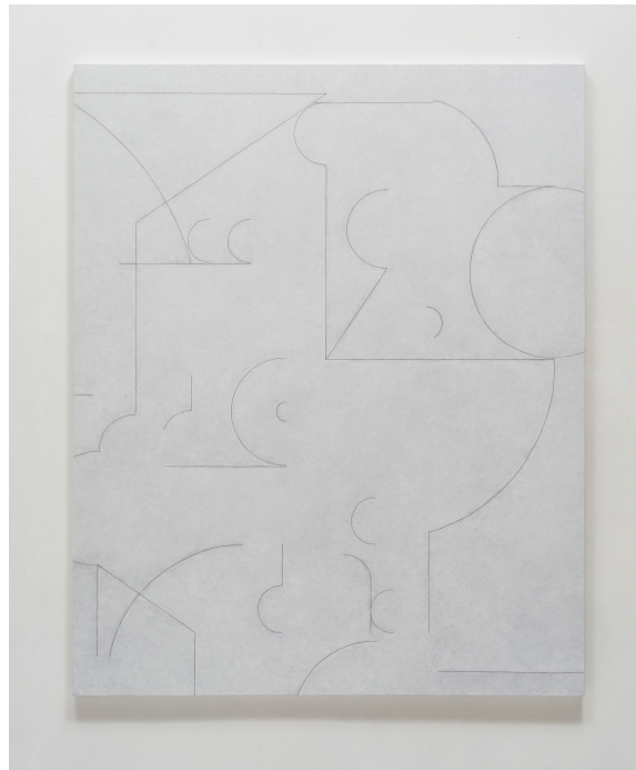
Air in Tires, 2019, oil and pencil on canvas, 162 x 130cm

Gallery Baton presents Line, Curve, A Colorful Gesture, a solo exhibition by Hoh Woo Jung (b. 1987), from April 4 th to May 4 th , 2019. Hoh's work begins with ambiguous and philosophical sentences combining abstract words and reflections of different states of objects. In his work, various different objects and figures unite, eventually arriving at a state of balance. Such images combining elements of uncertainty, tension, balance and imbalance function as a mechanism through which the artist portrays a sense of anxiety, emptiness and desolateness one habitually confronts in contemporary society.