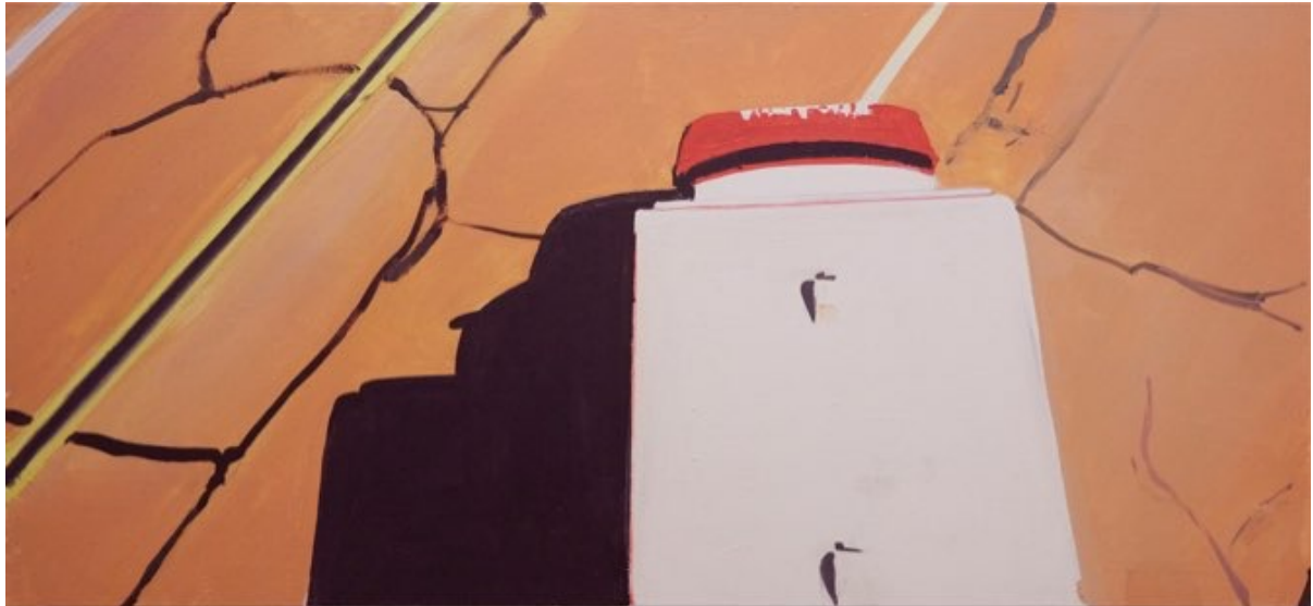
From The Bridge, 2017, oil on canvas, 70 x 150 cm

He has built a particular visual language based upon the observation of building facades and landscapes that are often neglected or forgotten. By analyzing and recombining hundreds of snapshots, van den Broek transforms the images into an abstract forms, essentially projecting new perspectives onto the familiar landscapes.