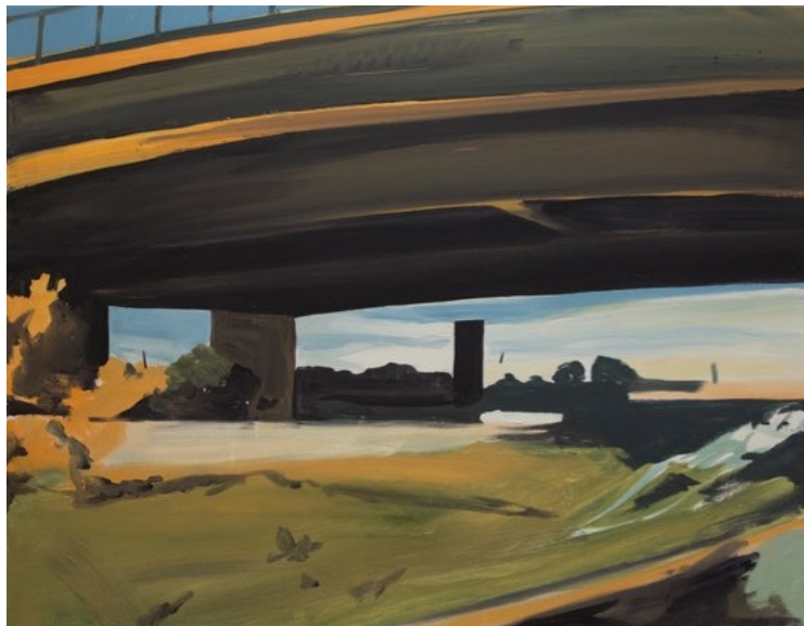
Glowing Day , 2017, oil on canvas, 88 x 115 cm

Gallery Baton is pleased to announce Koen van den Broek's solo exhibition, A Glowing Day, on view from March 20th to May 4th in Apgujeong, Seoul. The exhibition unveils new paintings by the internationally renown artist, works that readily traverse—or question—the boundaries between abstract and figurative art.