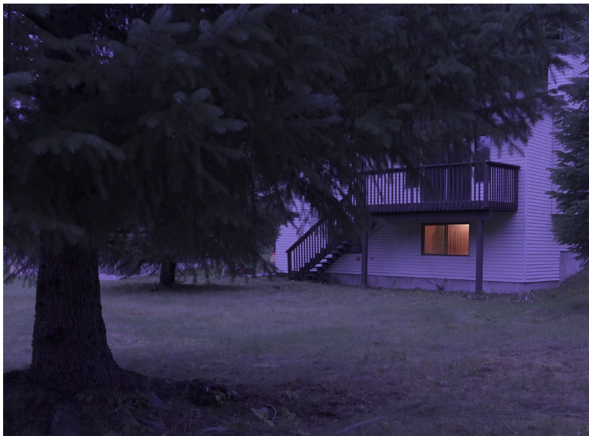
The Caretaker 2018 (video frame)

Press Release — opening February 1st and 2nd