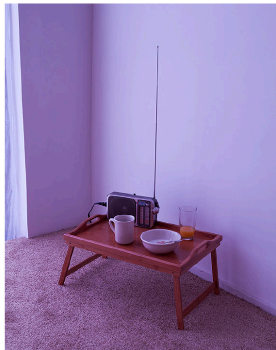
You'd Be So Nice to Come Home To 2016