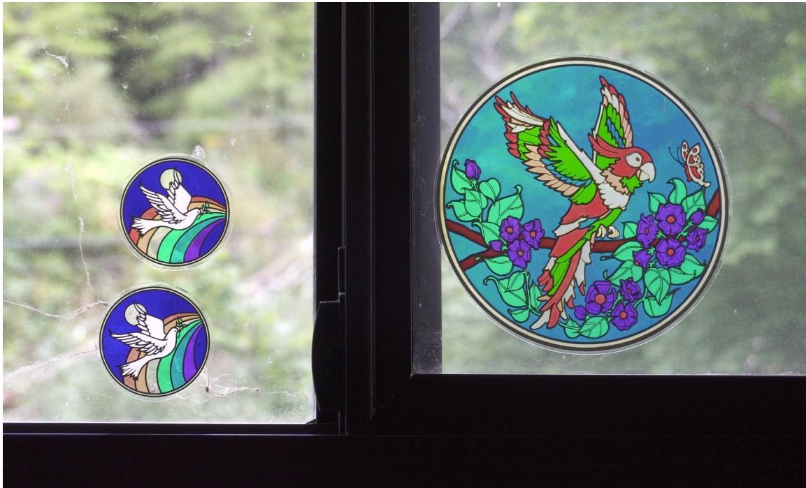
The Caretaker 2018 (video frame)