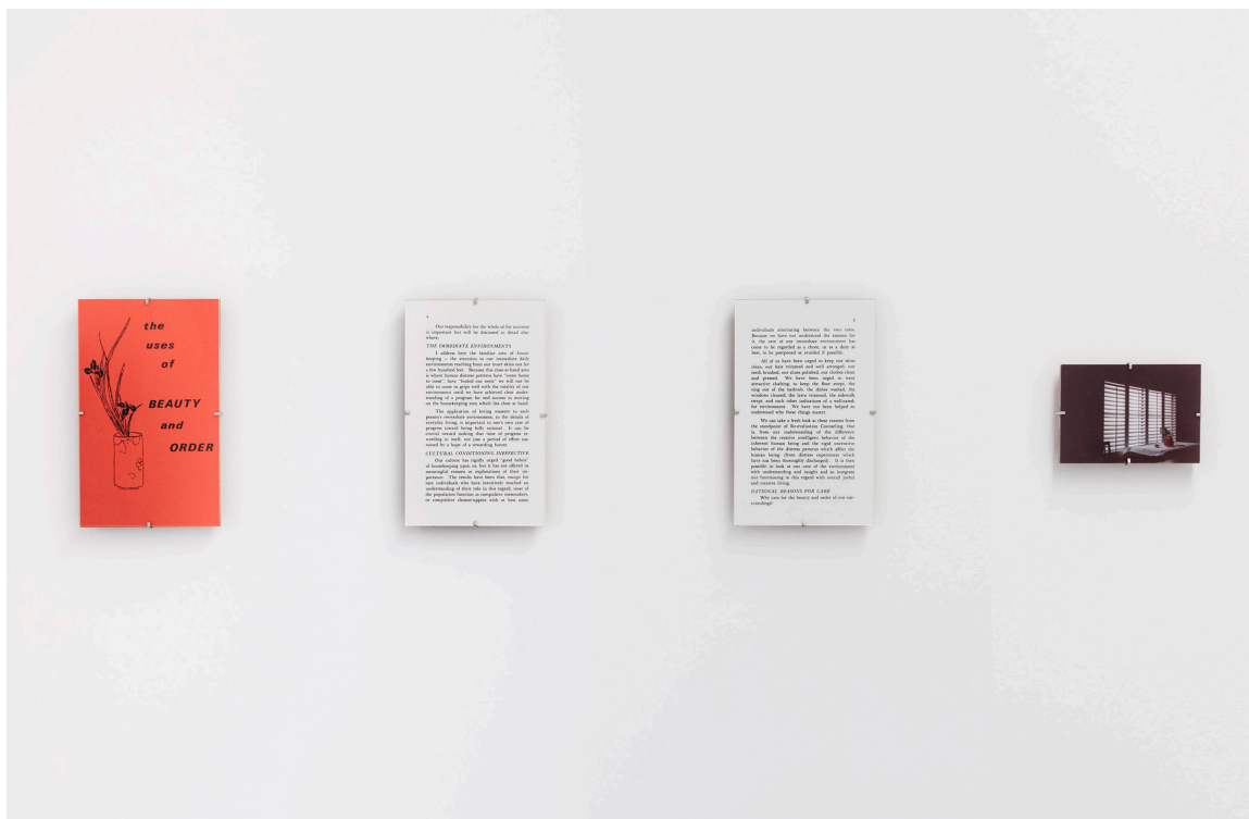
Good Habits 2019

The group of collages come from a recent body of work (2019-ongoing) and are comprised of found photographs and pages taken from a largely forgotten North American self-help sect founded in the mid-1950's and inspired by the ideologies and methods of Scientology. The group has been described as a cult, and has published many publications that focused on self-empowerment and optimization of everyday life.