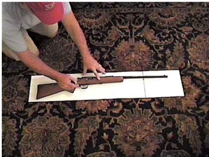
Still from “TRACE”, single-channel Hi8 video transfer to digital, 15 minutes 33 seconds