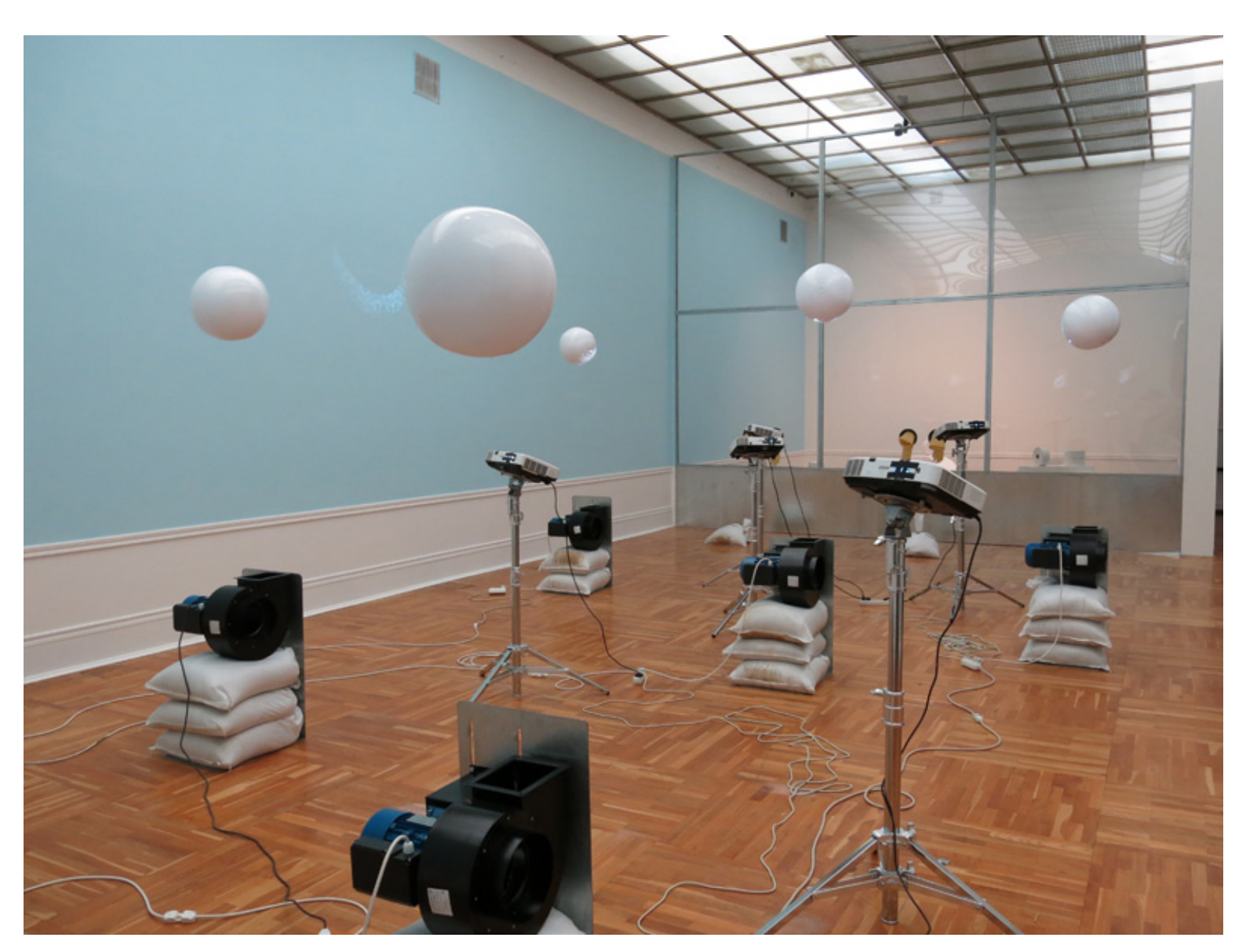
Nadim Abbas, Human Rhinovirus 14, 2016. Installation view, 7th Moscow International Biennale of Contemporary Art, 2017.