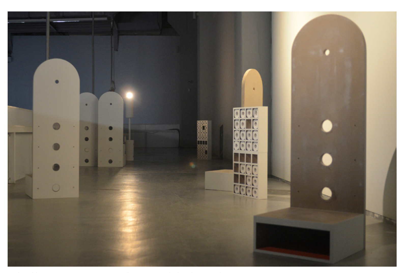
Nadim Abbas, 4 Rooms (-梯一伙), 2018. Installation view, 12th Shanghai Biennale.