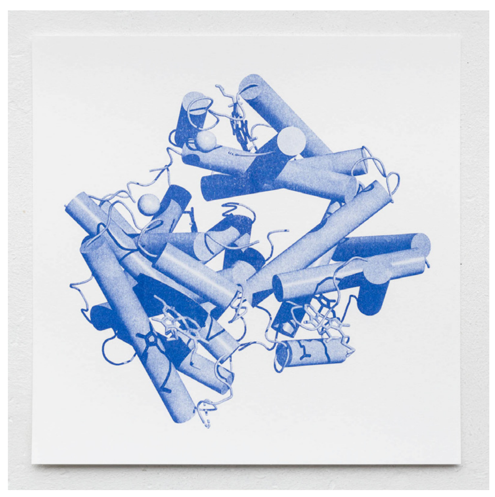
Nadim Abbas, Deoxyhaemoglobin (Homo Sapiens), 2017.