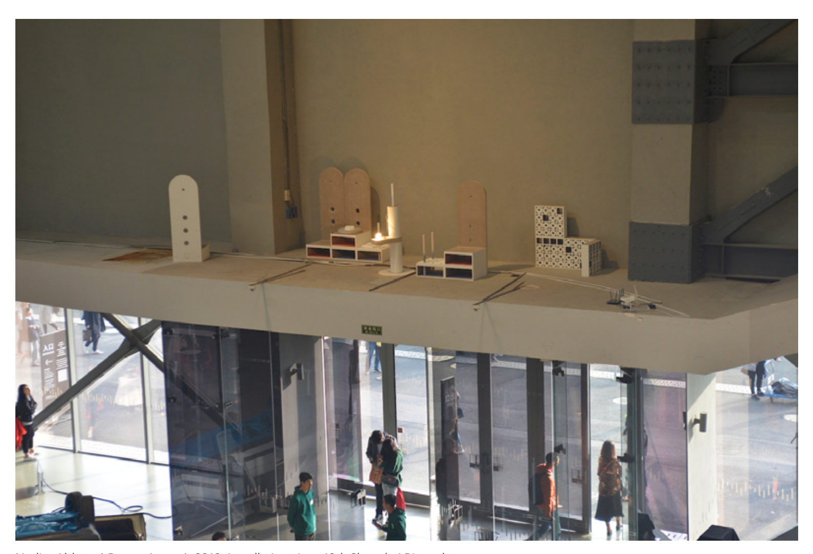
Nadim Abbas, 4 Rooms (-梯-伙), 2018. Installation view, 12th Shanghai Biennale.