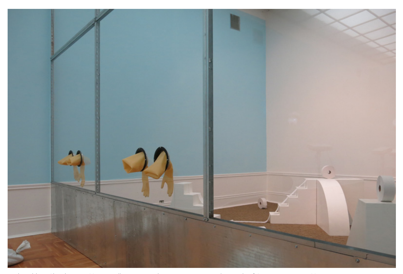
Nadim Abbas, Chamber 667, 2016. Installation view, 7th Moscow International Biennale of Contemporary Art, 2017.