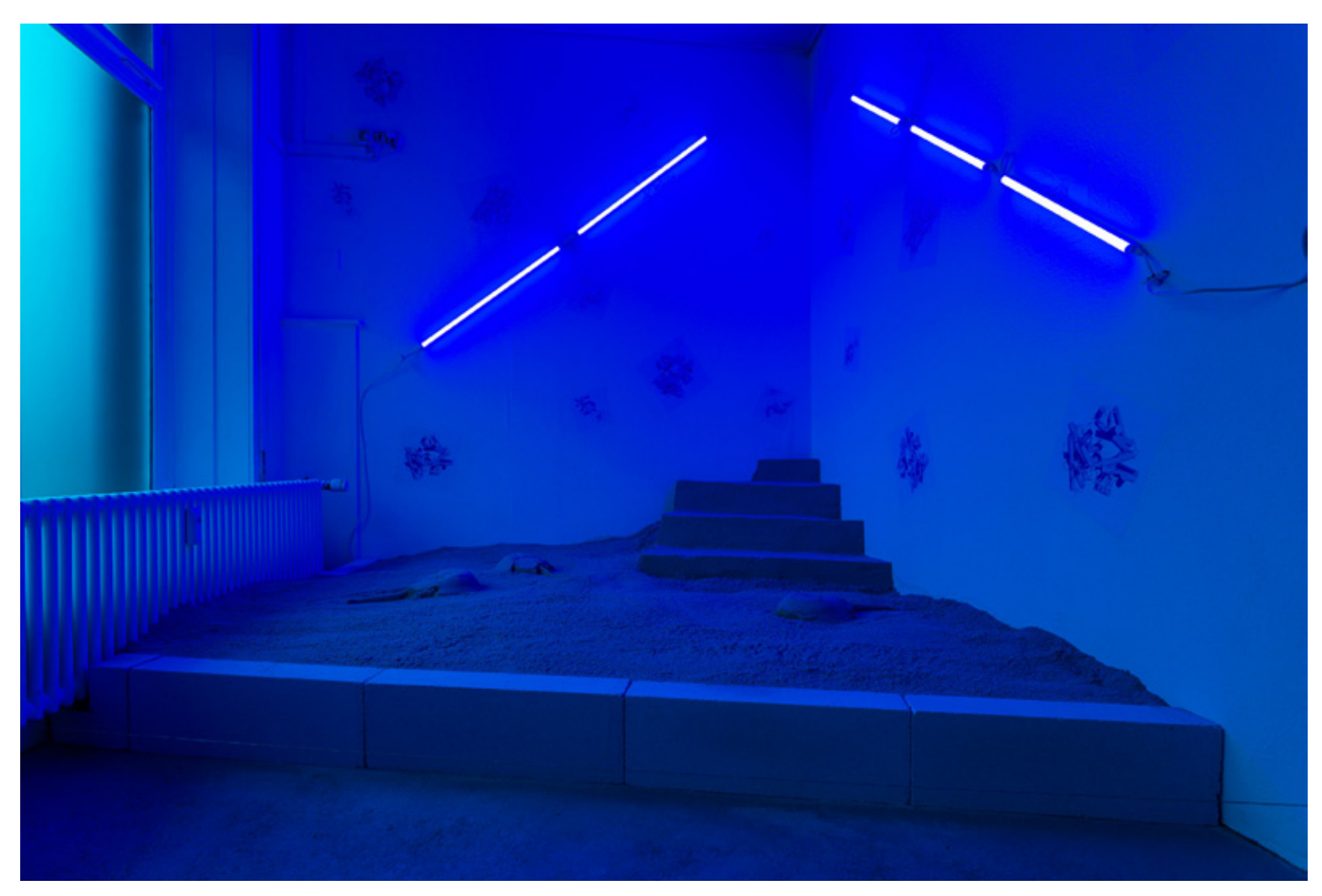
Nadim Abbas, Blue Noon, 2017. Installation view, Last Tango.