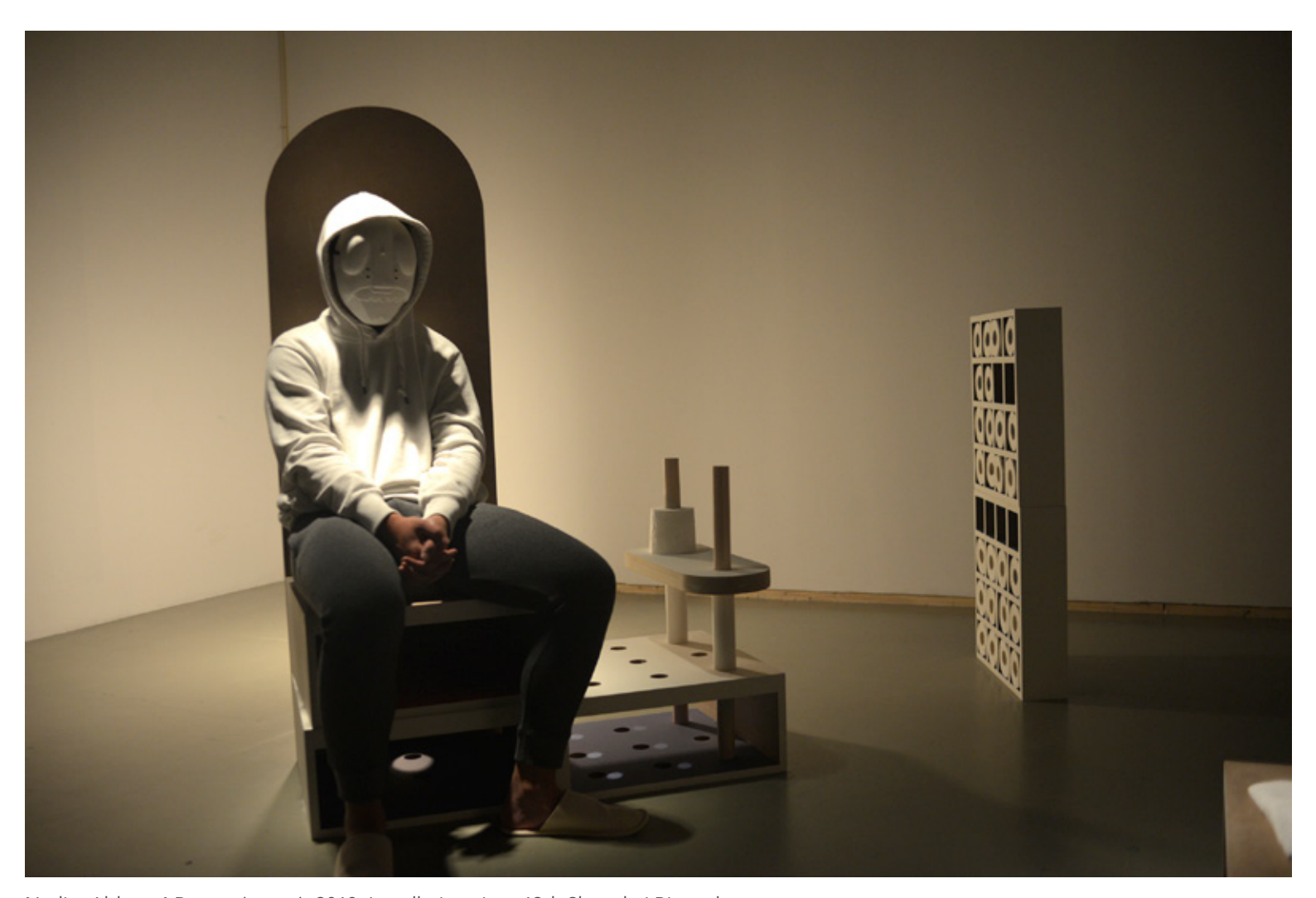
Nadim Abbas, 4 Rooms (-梯-伙), 2018. Installation view, 12th Shanghai Biennale.