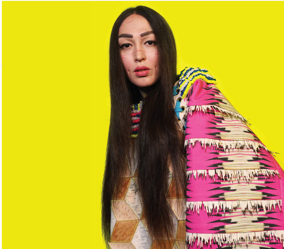
Jeffrey Gibson, Roxy , 2019. Courtesy of the artist, Sikkema Jenkins, NYC, Kavi Gupta, Chicago, and Roberts Projects, Los Angeles.