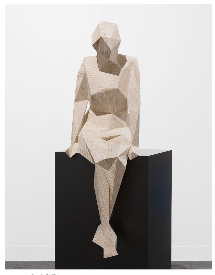
Lyllie , 2018. 桦木夹板、碳 | Birch plywood, carbon. 123 x 50 x 47 cm | 48 7/16 x 19 11/16 x 18 1/2 in 摄影 | Photo: Claire Dorn. © Veilhan / ADAGP, Paris 2019. 图片提供: 贝浩登 | Courtesy Perrotin