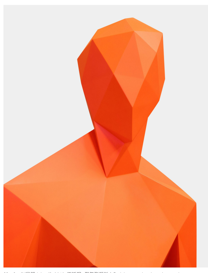
Manfredi (局部 / detail), 2019. 不锈钢、聚氨酯颜料 | Stainless steel, polyurethane paint 160 x 142 x 72 cm | 63 x 55 7/8 x 28 3/8 in. 摄影 | Photo: Claire Dorn © Veilhan / ADAGP, Paris 2019. 图片提供: 贝浩登 | Courtesy Perrotin