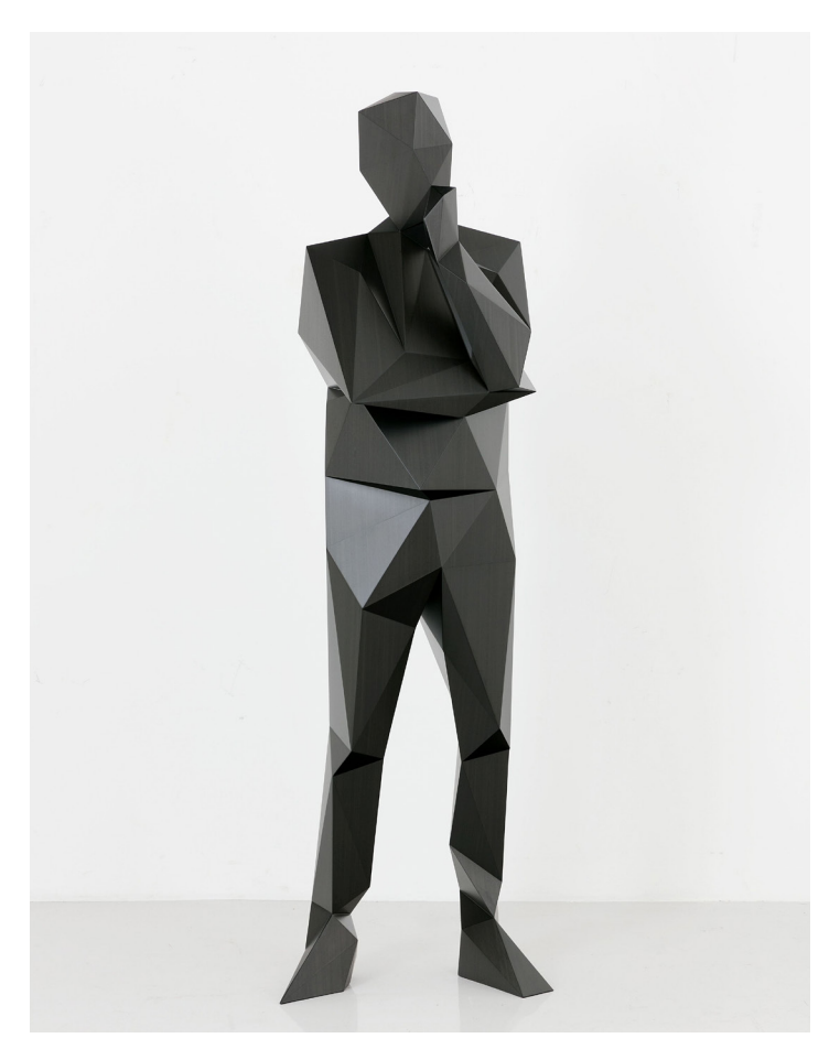
Philippe Zdar, 2017. 碳 | Carbon. 230 x 72 x 49 cm | 90 9/16 x 28 3/8 x 19 5/16 in © Veilhan / ADAGP, Paris 2019.

"橘色频道"也让人想到一档电视或广播节目。泽维尔在作品与收音机之间感到了强烈的联系,这些抽象、飘忽的事物,观者在收听后即变得具体化。展览本身可以被解释为各种干预与音乐构成的整体,就像一个无线电频道。同时存在分歧与连续性。形状与声音相连,创造出独特的节奏。