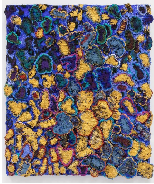
Fig 2. Nabil Nahas, Untitled , 2017, acrylic on canvas, 83.8 x 71.1 cm; (33 x 28 in.)

and became a repository for his relief paintings of layer upon layer of organic shapes covered in luminescent, hyperreal colours. Nahas often mixes pumice powder into his paint, further enhancing the materiality of his work, giving the impression of pure ground pigment or coral reefs.