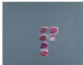
Martha Jungwirth Mouths , 1971