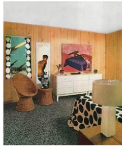
Martha Rosler Woman with Cannon Dots from the series House Beautiful: Bringing the War Home , 1967-72 Courtesy Martha Rosler und Galerie Nagel Draxler Berlin/Cologne