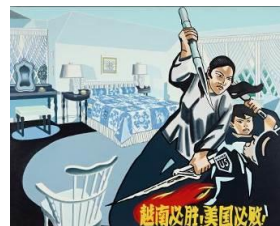
Erró American Interior # 5 , 1968 © mumok – Museum moderner Kunst Stiftung Ludwig Wien, © Bildrecht, Vienna 2018