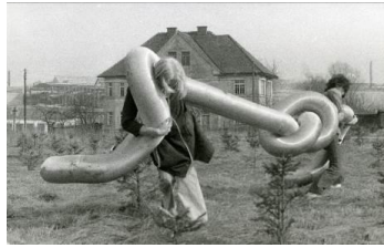
Charles Kaltenbacher, Beni Altmüller Tubing loop , 1975 photo: Wolfgang Lackner, © Beni Altmüller