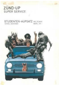
Zünd-Up, Super Service Student Top Piece from the project The Great Vienna Auto-Expander , 1969

The year 1968 marks a turning point that ushered in a new era. Across Western Europe and in the United States student protests and workers' revolts called into question the post-war power structure itself, while Soviet tanks bulldozed the Prague Spring into the ground and signalled the end of the hope that the Eastern Bloc would open up to the West. In Upper Austria's political scene, too, a new wind was making itself felt which brought change to the living conditions and the culture of an entire generation and whose influence continued until well into the 1980s.