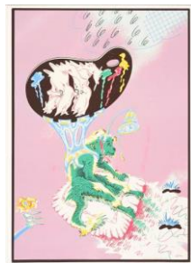
Christian Ludwig Attersee Gay palette , 1972 LENTOS Kunstmuseum Linz, © Bildrecht Vienna, 2018