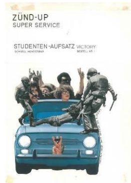
Zünd-Up Super Service Student Top Piece from the project The Great Vienna Auto- Expander , 1969