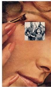
Martha Rosler Makeup / Hands Up from the series House Beautiful: Bringing the War Home , 1967-72 Courtesy Martha Rosler und Galerie Nagel Draxler Berlin/Cologne