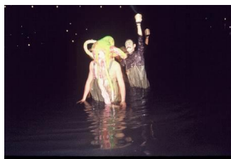
Julius Mende/ Josef Nöbauer Action The baptism of the New Man , pond in front of the JKU, 1969