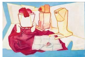
Maria Lassnig Breakfast with Ear, 1967