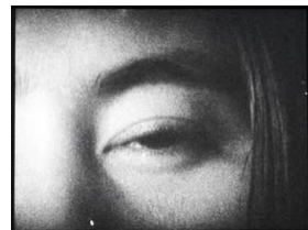
Yoko Ono Eye Blink , 1966