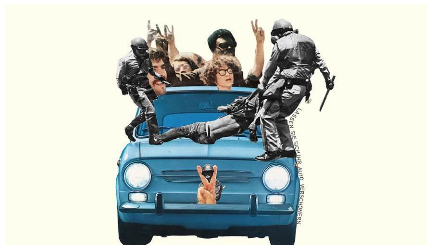
Zünd-Up, Super Service Student Top Piece from the project The Great Vienna Auto-Expander, 1969

Landesgalerie Linz 4 October 2018 until 20 January 2019