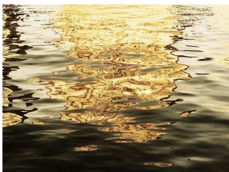
Yosuke Takeda "161234", 2013 LightJet print