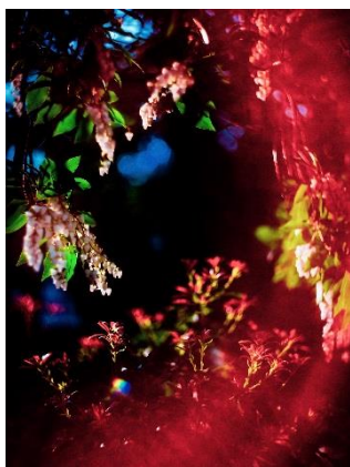
Yosuke Takeda "071949", 2019 LightJet print