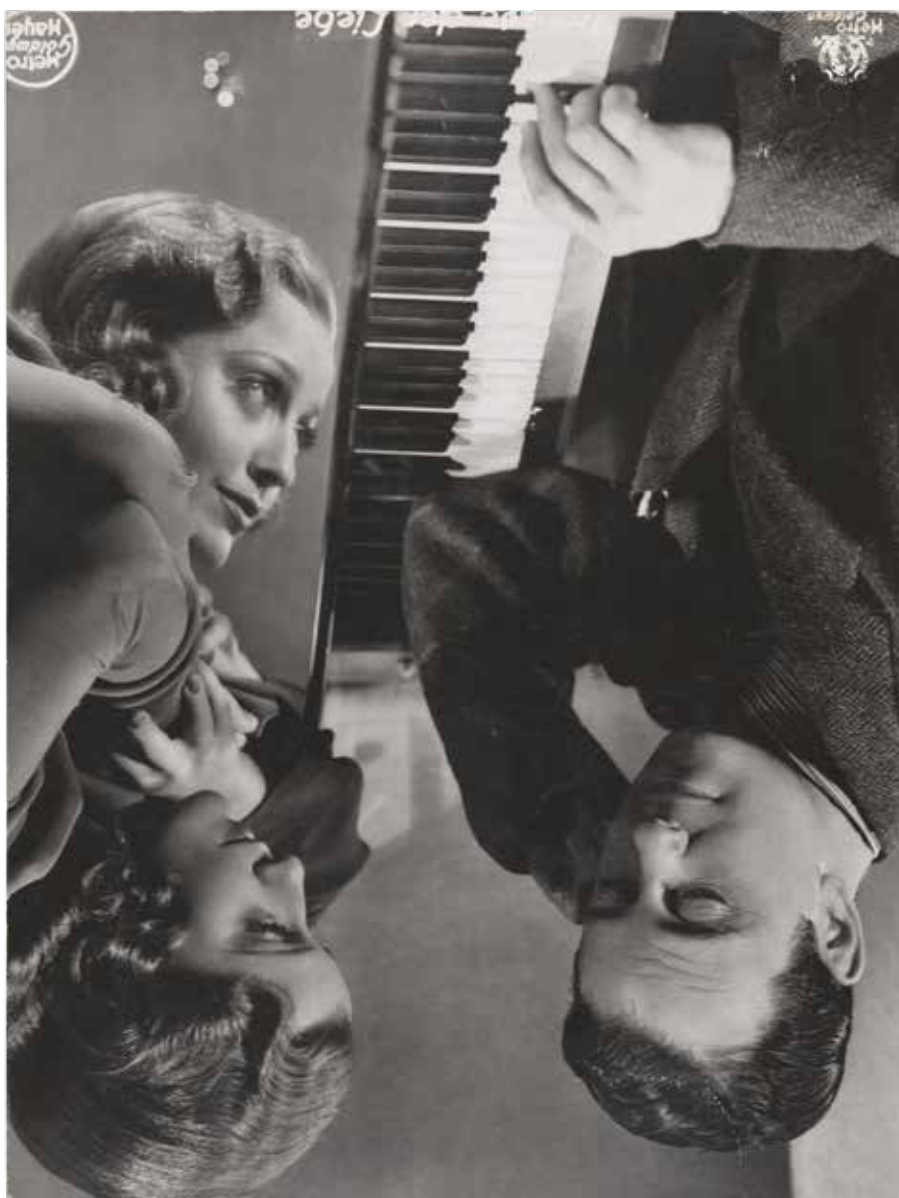
Untitled , 1977 Found photographic film-still, 27 × 19.4 cm. Private Collection.