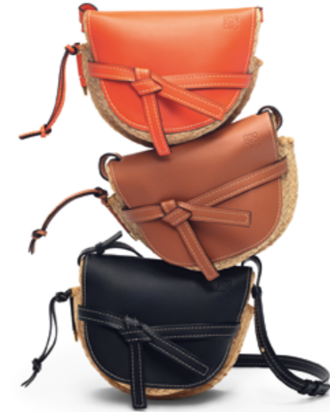
Lazo Bucket Bag, 2019